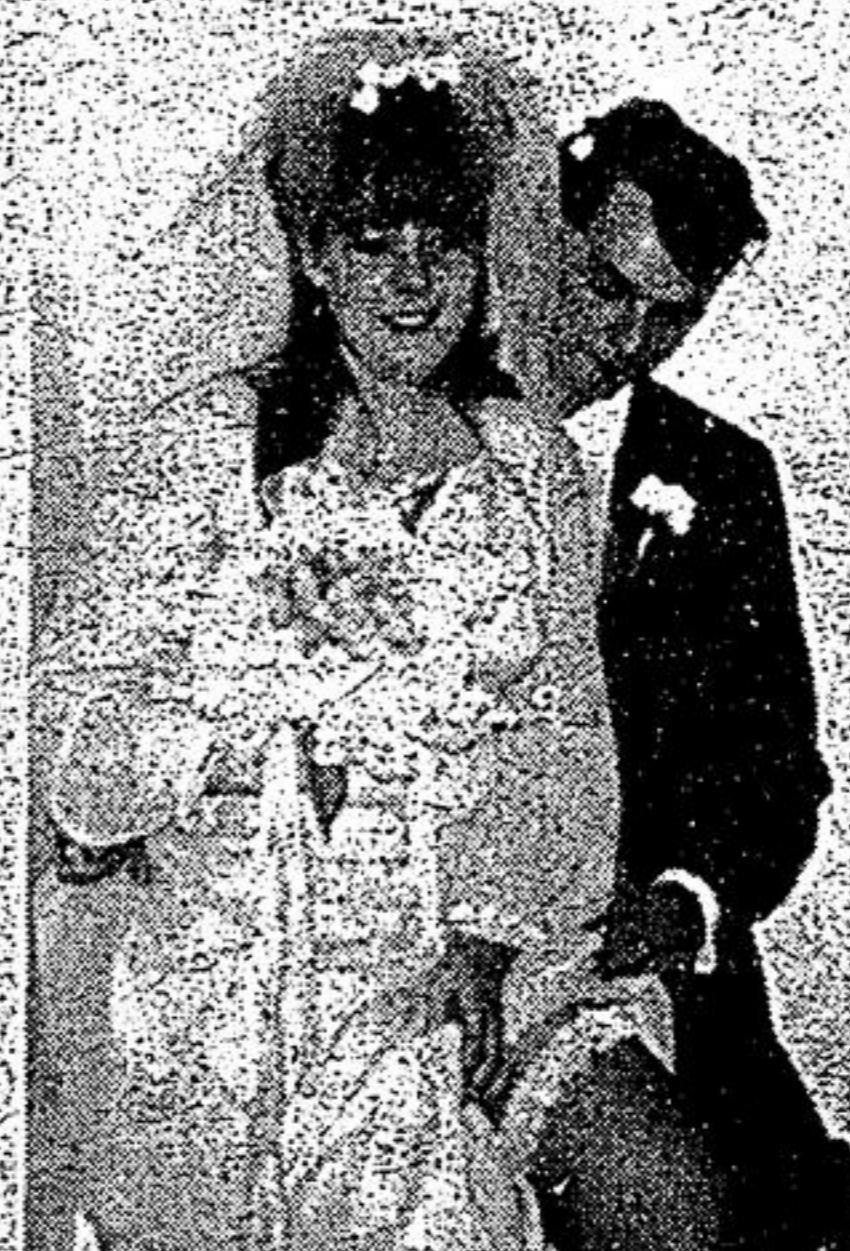
from the little family