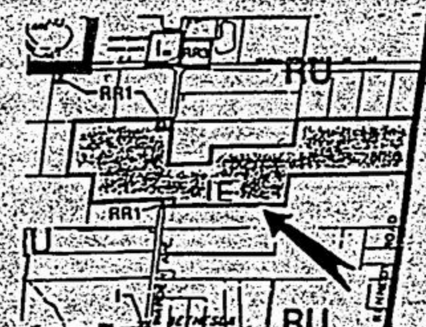
18.4(k) Subject Lands

1. Permitted Uses Crushing, batching, screening, washing, stockpiling, storage and weighing of materials acquired from off-site shall be additional uses permitted on the Subject Lands.