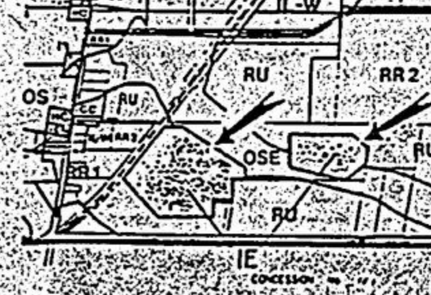
18.12(f) Subject Lands

1. Permitted Uses Crushing, batching, screening, washing, stockpiling, storage and weighing of materials acquired from off-site shall be additional uses permitted on the Subject Lands.