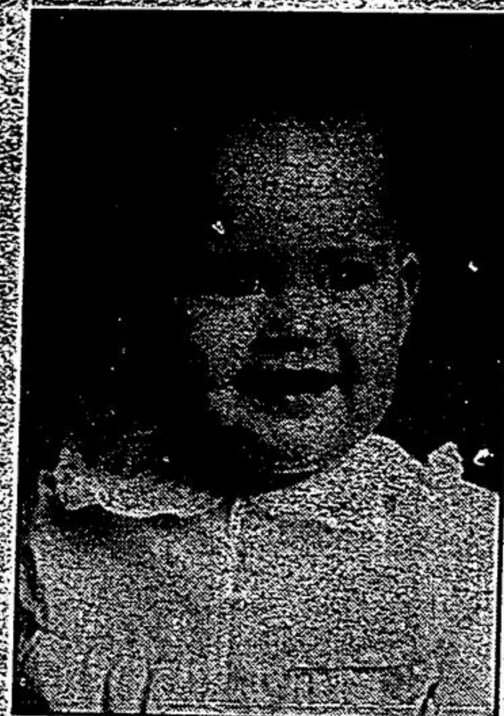
Do you know this baby?