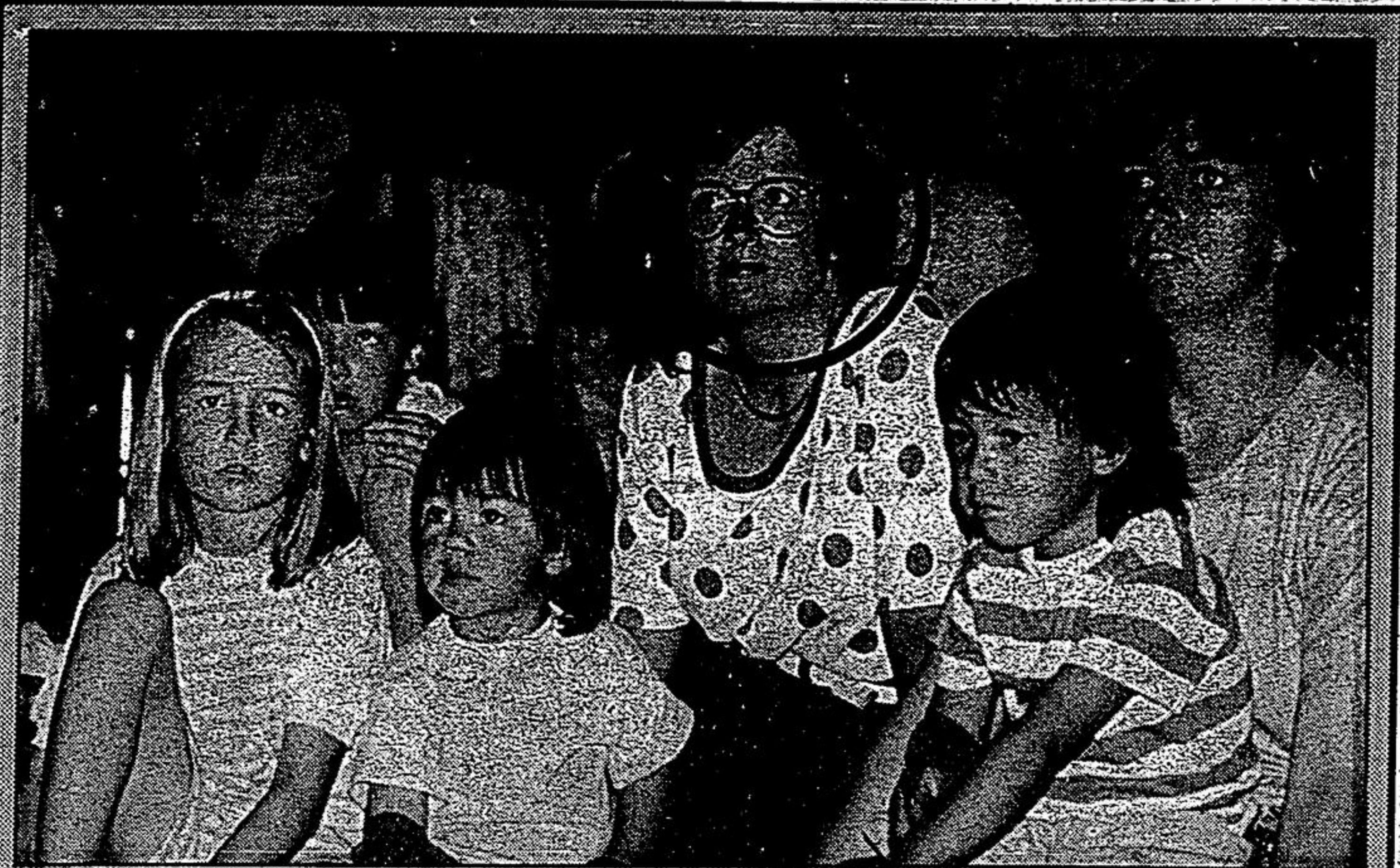
Here's looking at you

A good sized crowd turned out last Saturday at the Stouffville Library to see The Snake Man circled in this photo, you've won $25 in our weekly contest. Drop by the Tribune office at 54 Main St. West to claim your prize. If you are the person