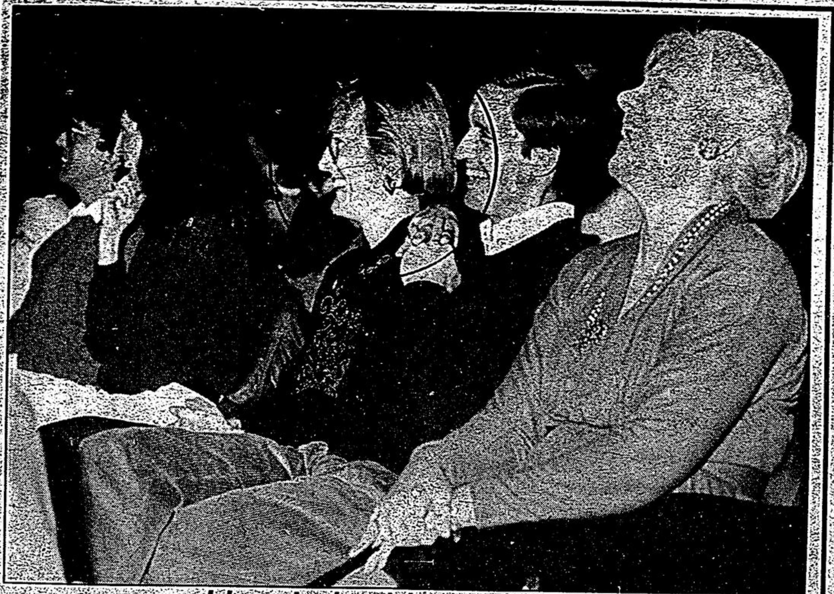
Here's looking at you!

Laughs were the order of the evening last Saturday night in Uxbridge when the Second City Touring Company came to town. Are you the person circled in this photo? If so, you've won $25. Come to the Tribune at 54 Main St. West in Stouffville to collect your prize.