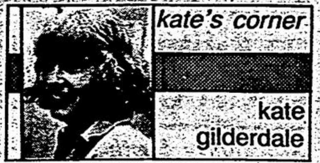
kate's corner kate gilderdale