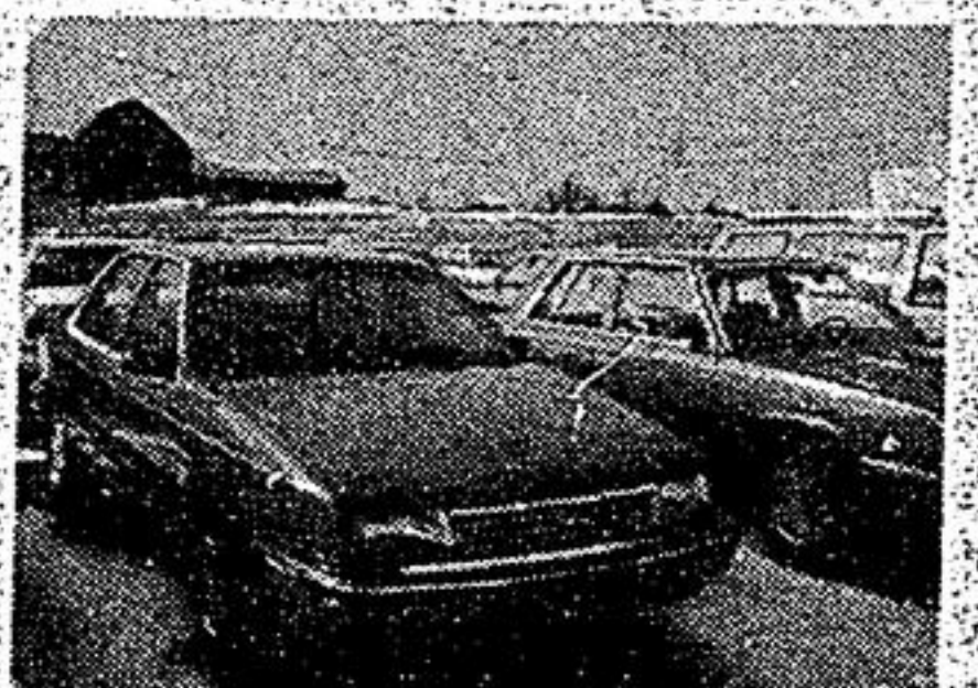
1989 Dodge Shadow or Sundance 4 door, air cond., P.S., P.B. Automatic, rear defogger. As low as $10,595.00. 8 to choose from.

Nothing Down OAC Balance of 7-yr. 115 Warranty Ava.