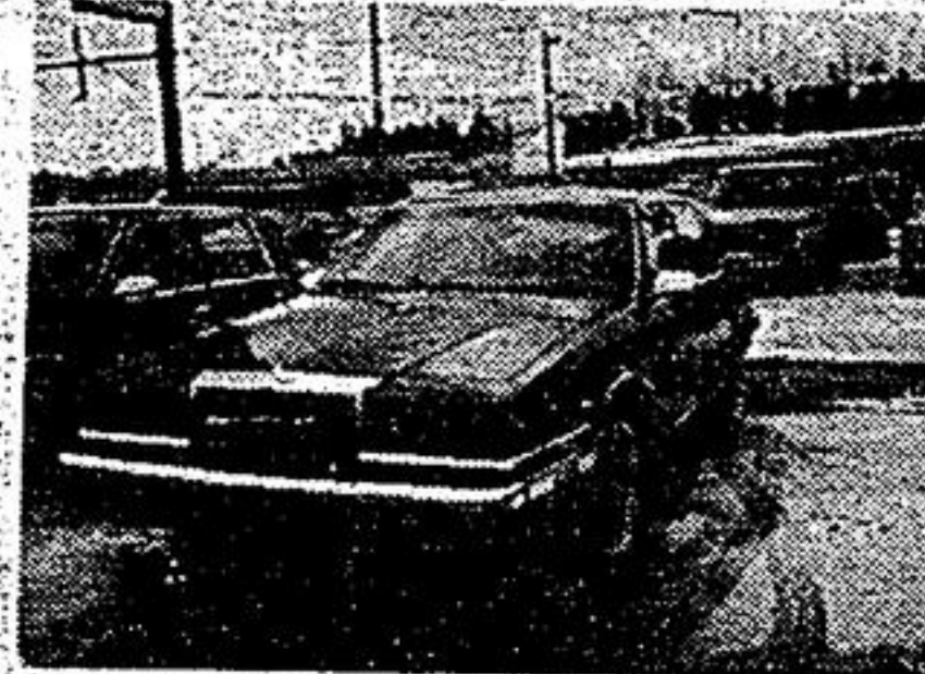
1989 New Yorker Loaded, black and red.