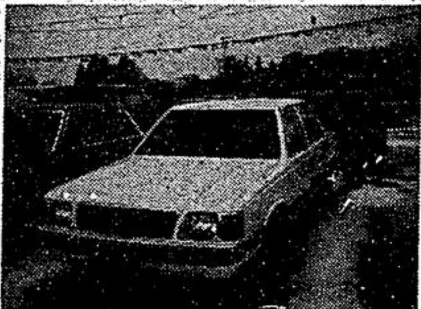
1988 K car P.S., P.B., A.M., F.M. Automatic, air cond. 4 to choose from.