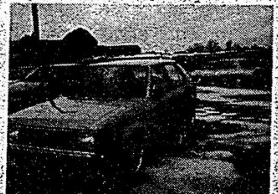
1989 Dodge Horizon P.S., P.B., A.M., F.M. Air Cond. Automatic, rear defogger. 6 to choose from. Priced to sell.