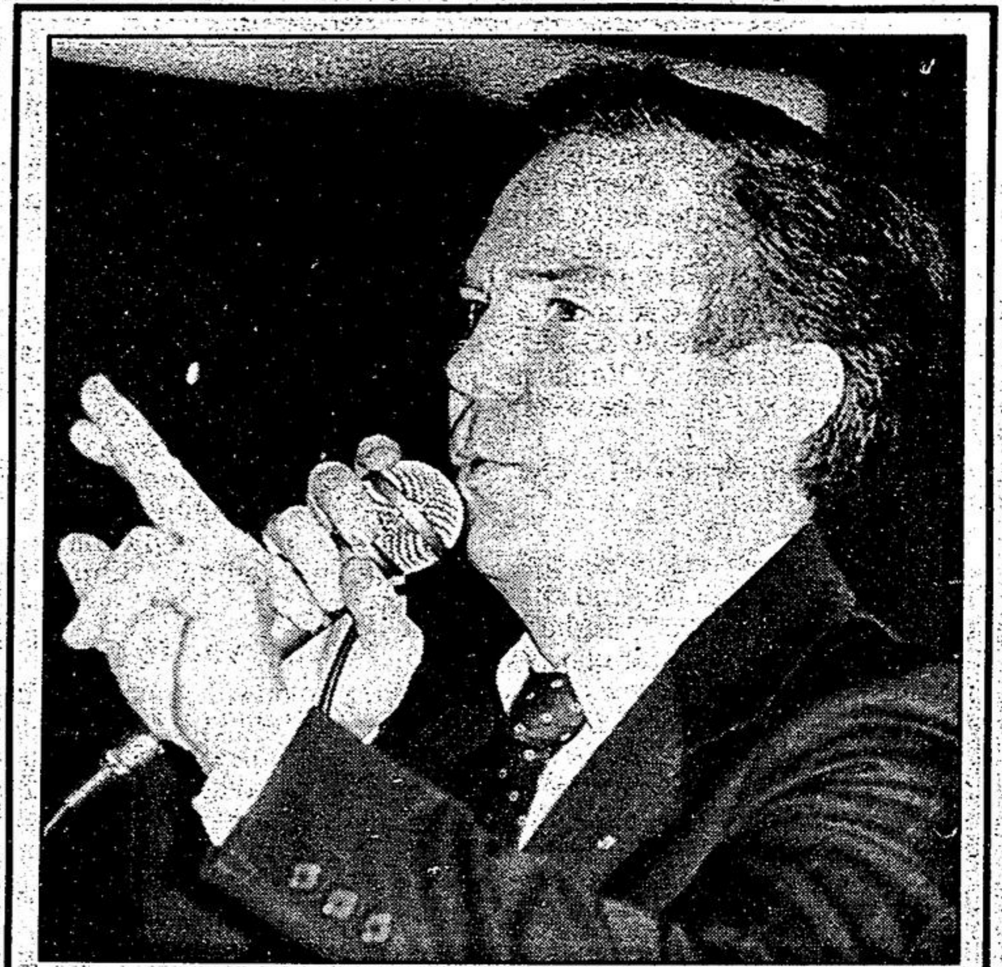
Going, going, gone...