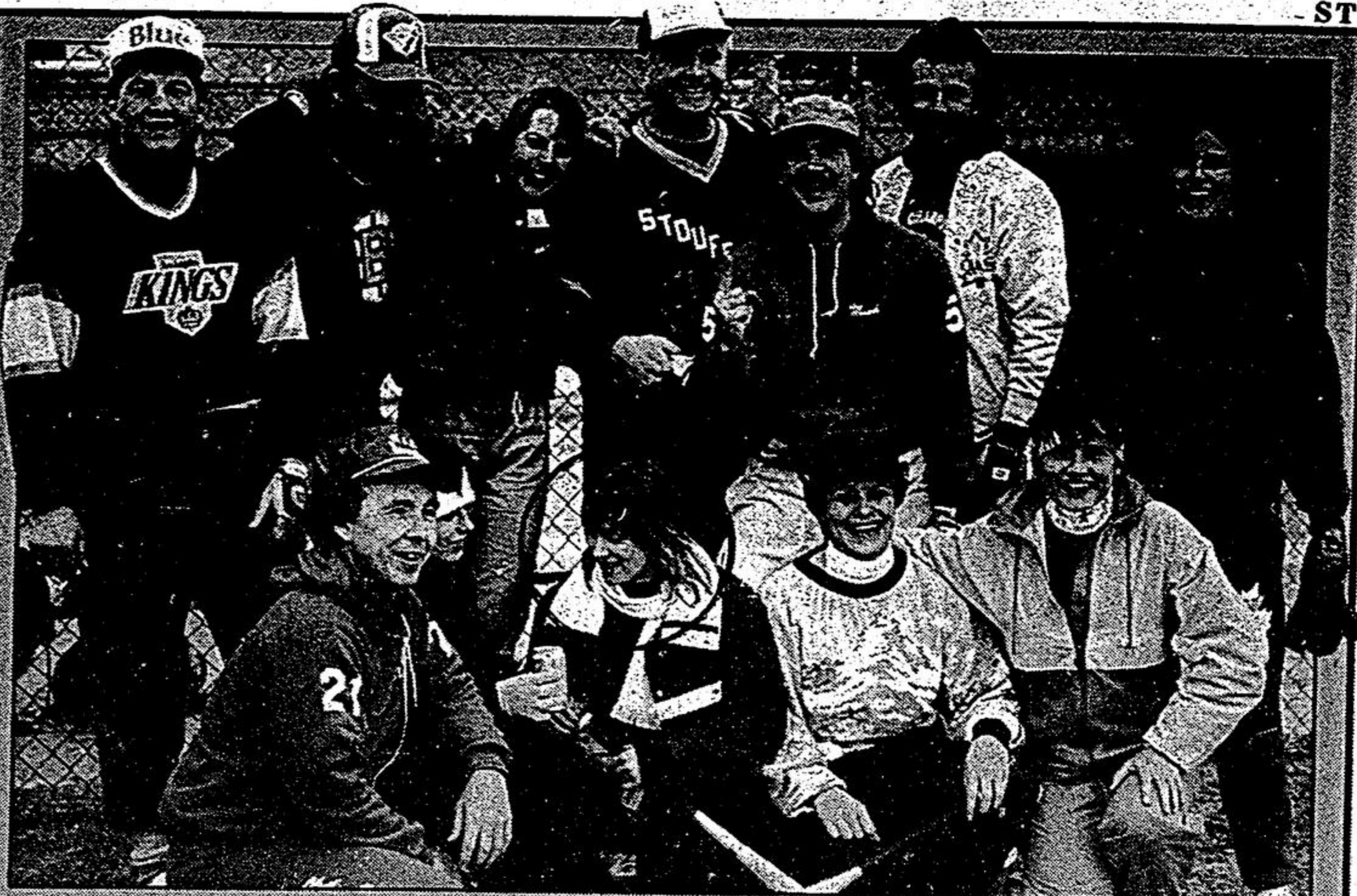
Here's looking at you