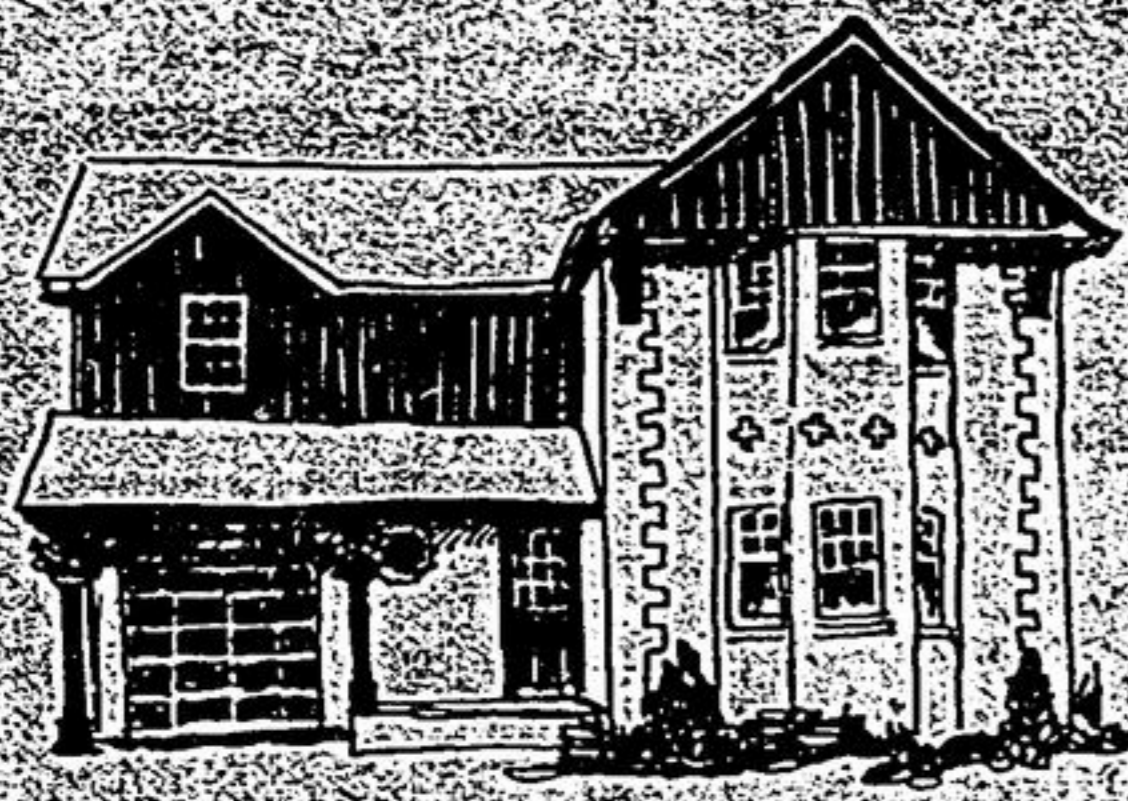
Country Tyme Realty Ltd. 640-5090.