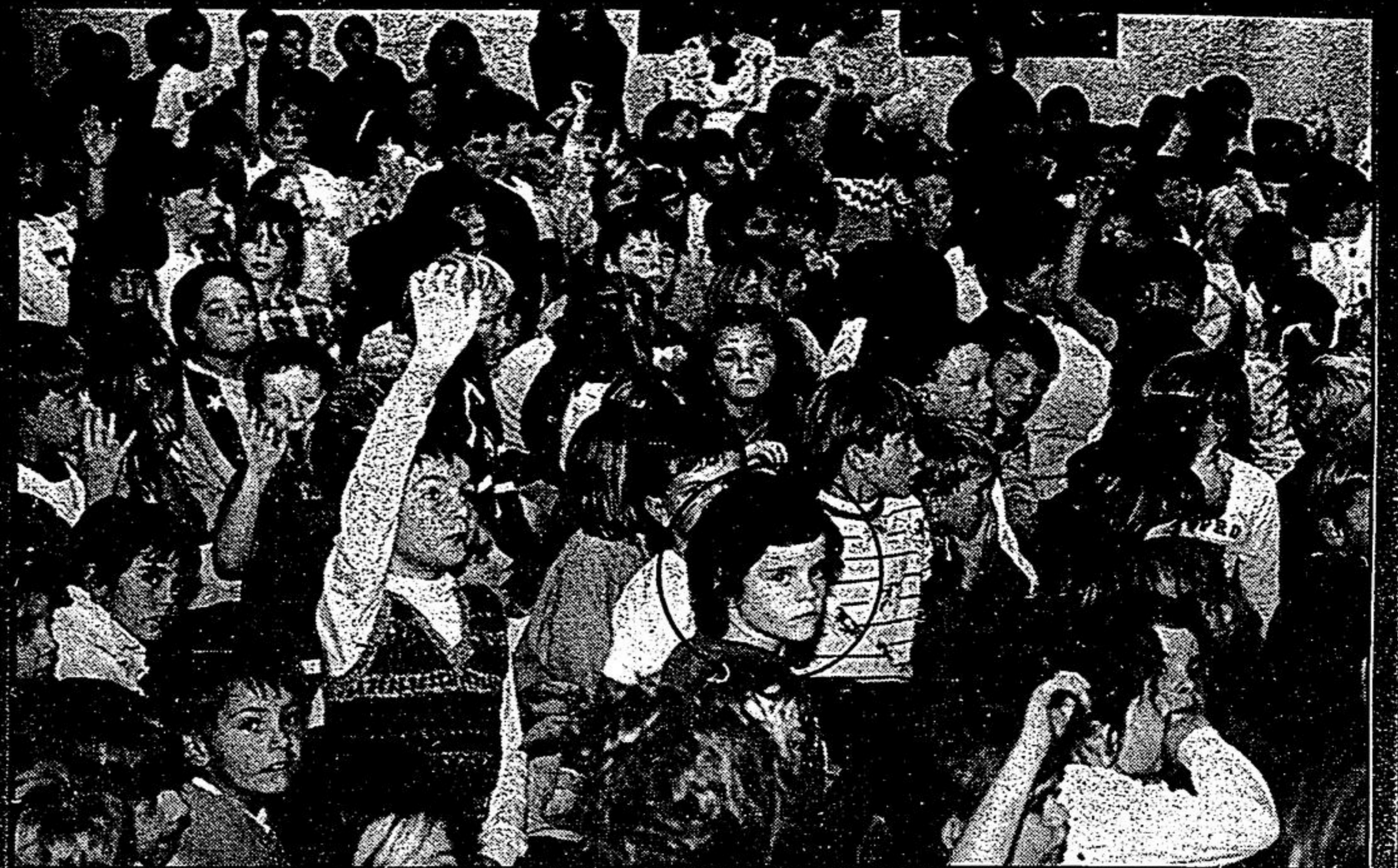
Children at Summitview Public School take part in a Wednesday afternoon performance of Beauty and the Beast . If you are the person circled in this question and answer period following the Ontario photograph, come into the Tribune office at 54 Main Street to collect your $25 prize.