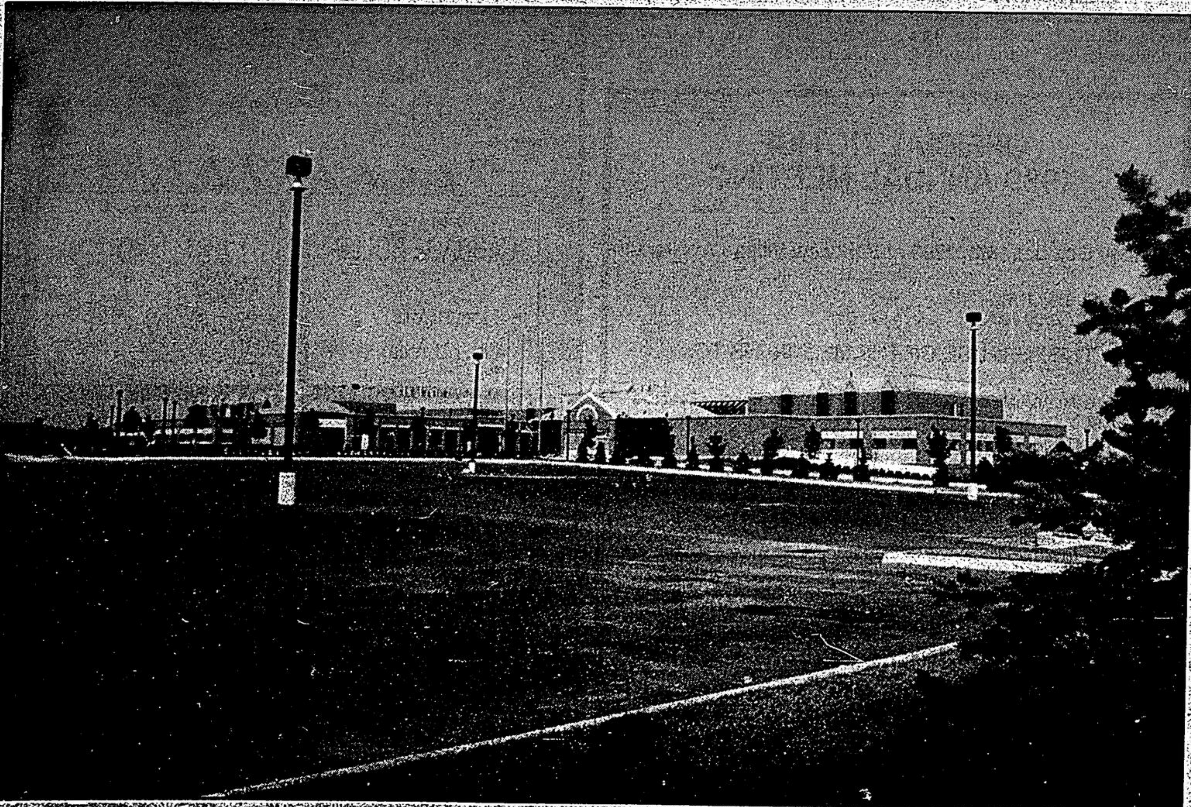
The exterior of the Markham-Stouffville Hospital has reached its completion. Now, work crews are busily preparing the interior of the hospital for its opening next winter. One of the striking things about the building is the amount of natural light inside. Creative use of windows and skylights gives it a fresh feel.

If you are willing to give a few hours of your time to the hospital, give Rigo a call at 294-6660.