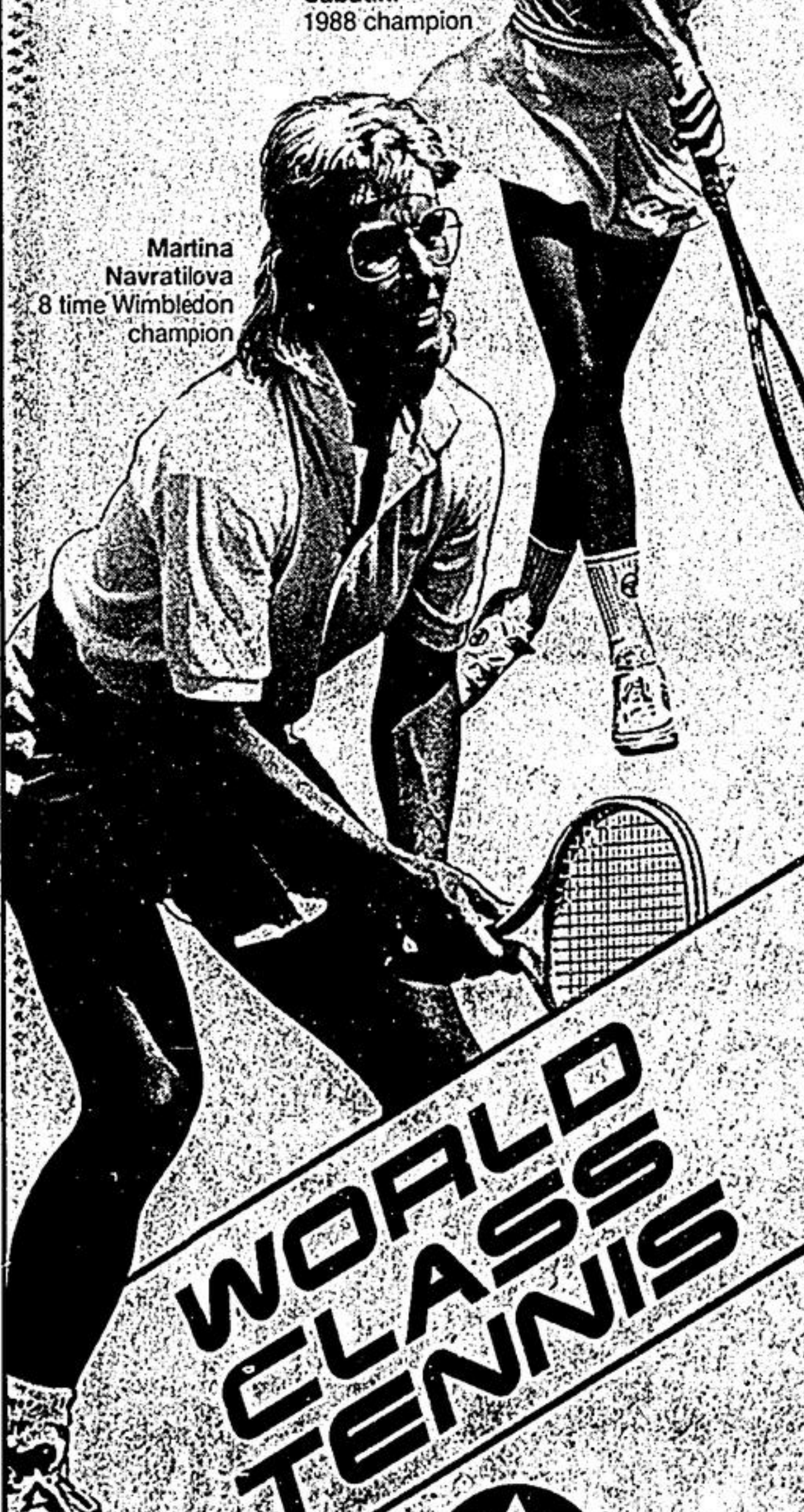
Gabriela Sabatini 1988 champion

August 19-27 National Tennis Centre, York University Power and finesse. Grace and beauty. Exciting centre court action daily. The $375,000 Player's Ltd. Challenge has it all for fans of world class tennis. Current champions face the challenge of rising new stars on the international tennis circuit. Don't miss this opportunity to see the greatest stars of tennis. Tickets are available at all Ticketron outlets or by calling Teletron (416) 872-1212 or at the gate.