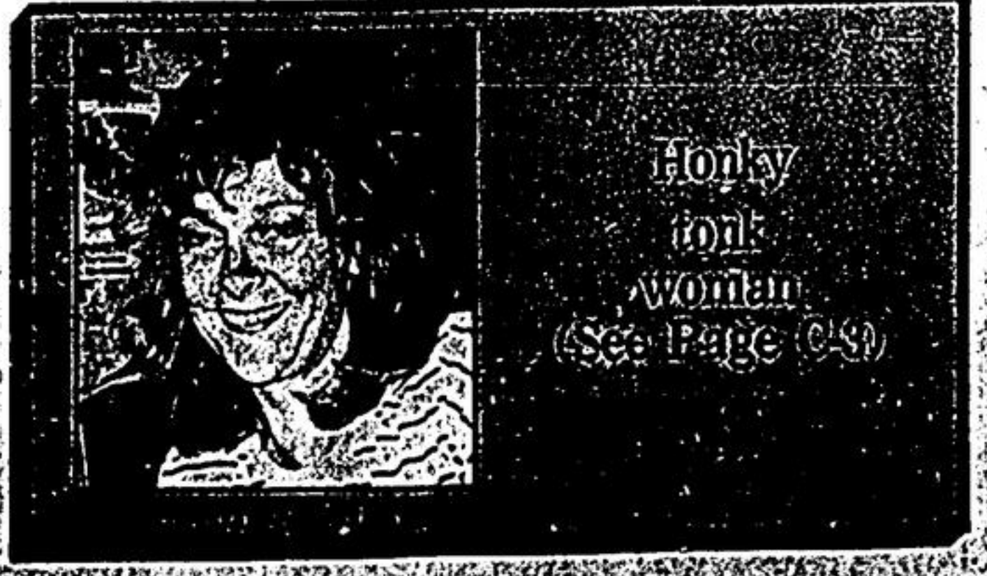
Honky tonk woman (See Page C3)

Good samaritan If you're receiving Focus on its own this week you missed a story in the Tribune news section on a real-life good samaritan. Also in the Trib, a feature on the York-Durham sewage system and the story of the effect recent dry weather has had on local crops. If you'd like to read about all the news in the Whitchurch-Stouffville area, subscribe to the Tribune by calling 640-2100.