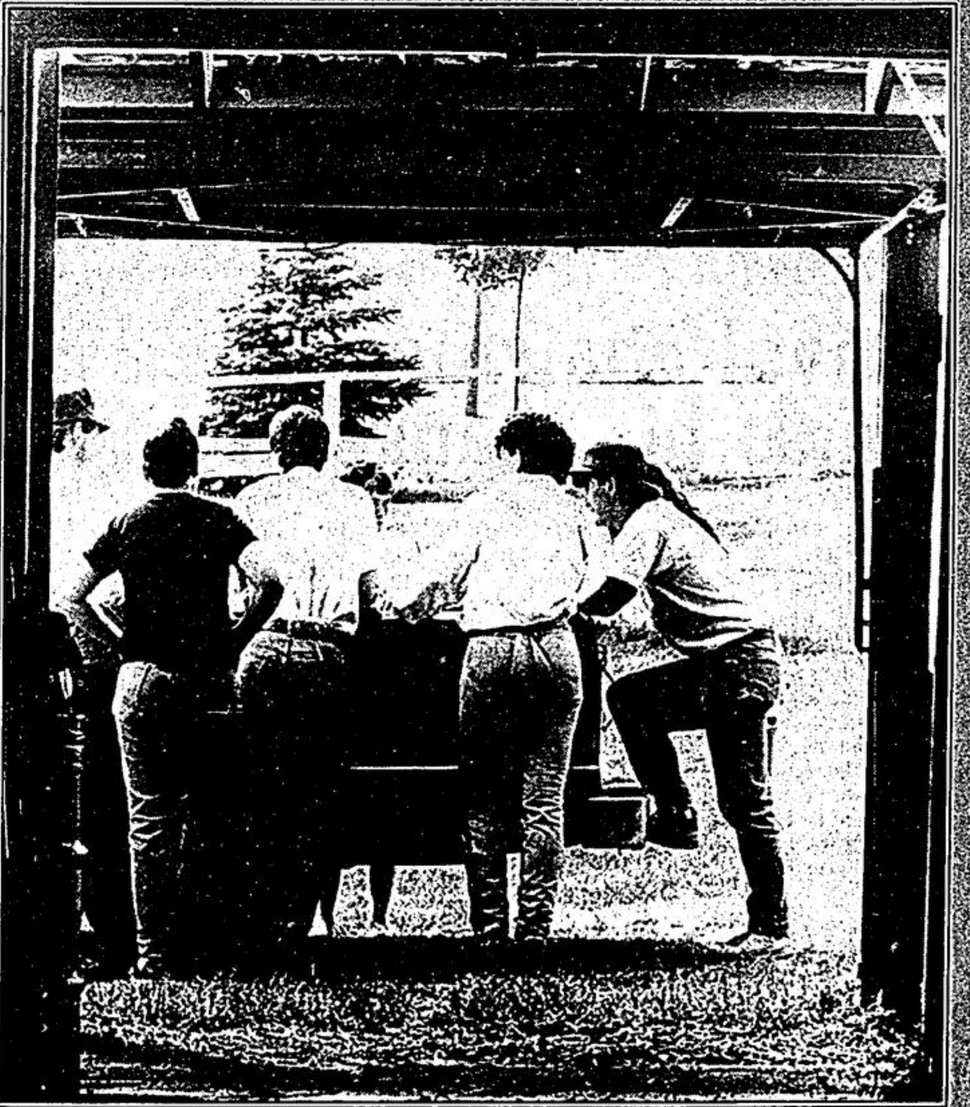
A group of people participating in the shorthorn event caught up on some small talk in between chores. They took the opportunity to share laughs around this pick-up truck Saturday morning.