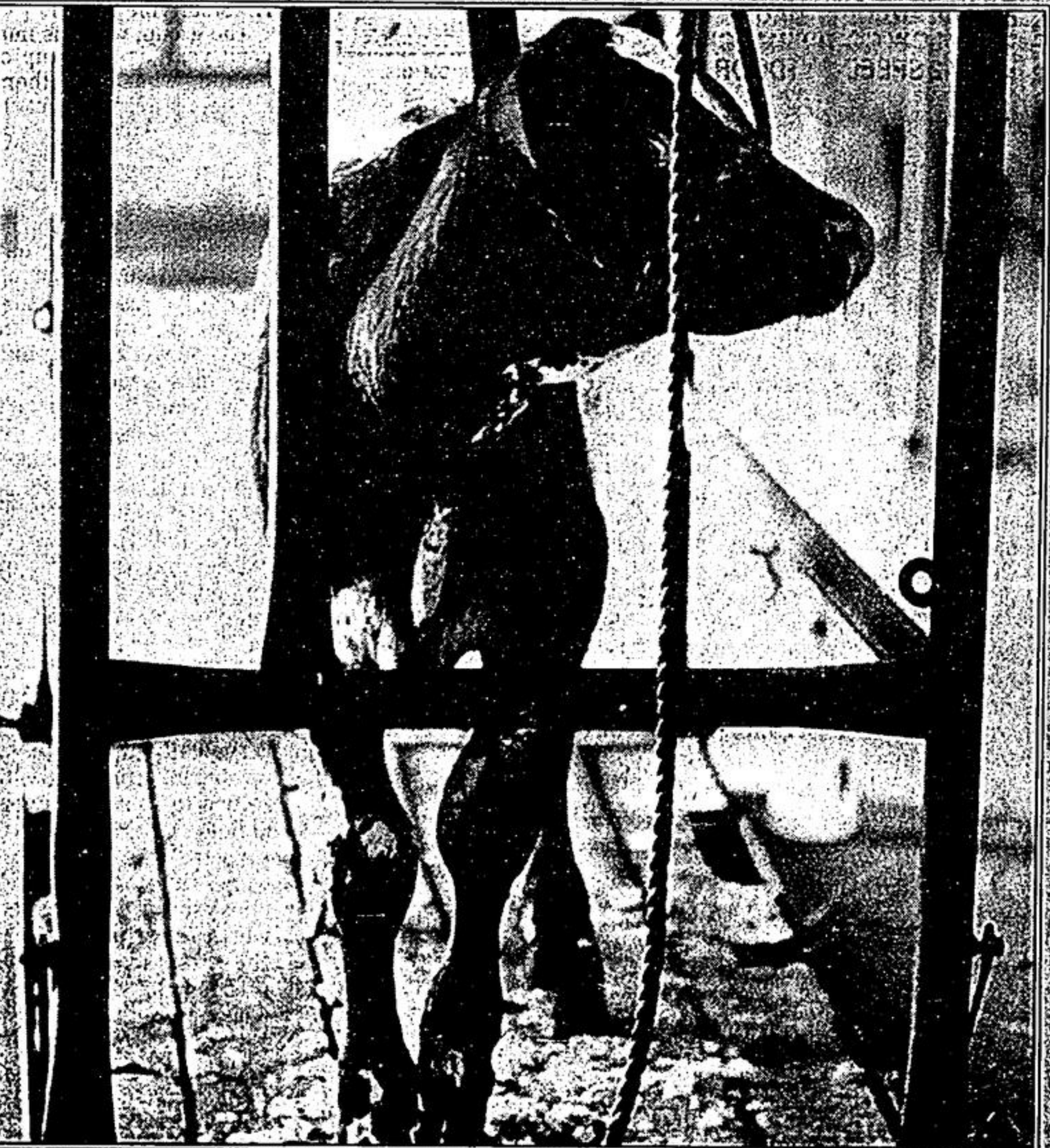
This young steer seems a little 'barred' with all the standing around as he awaits a grooming session in the barn area prior to his trip into the auction theatre.