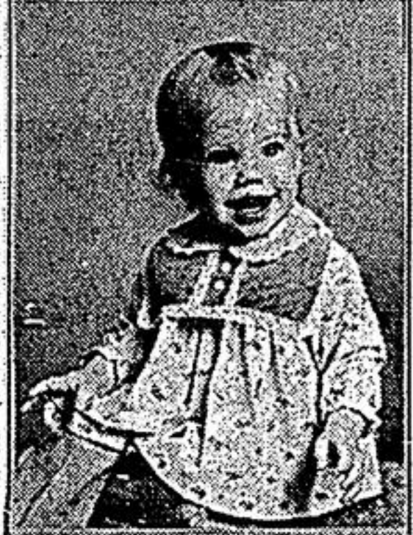
(Frame not included)

At Sears, our photographers are experienced professionals in every way. They make sure your baby looks just right, so your portraits come out great! Also available: Instant Passport Photos. Price includes $2.00 deposit. Rates our selection. White and Black Back grounds. Double feature and other Special Effects Formats not available in advertised package. Each additional person in portrait is $2.00 in addition to the package price. No appointment necessary. Adults & families welcome. Use your Sears Card. *approximate sizes. Studios located in Sears retail stores and in clearance centres in Dixie Value Mall, Rexdale Boulevard and Warden Avenue, also in catalogue stores in Morning side in Scarborough and Galleries Mall in Toronto.