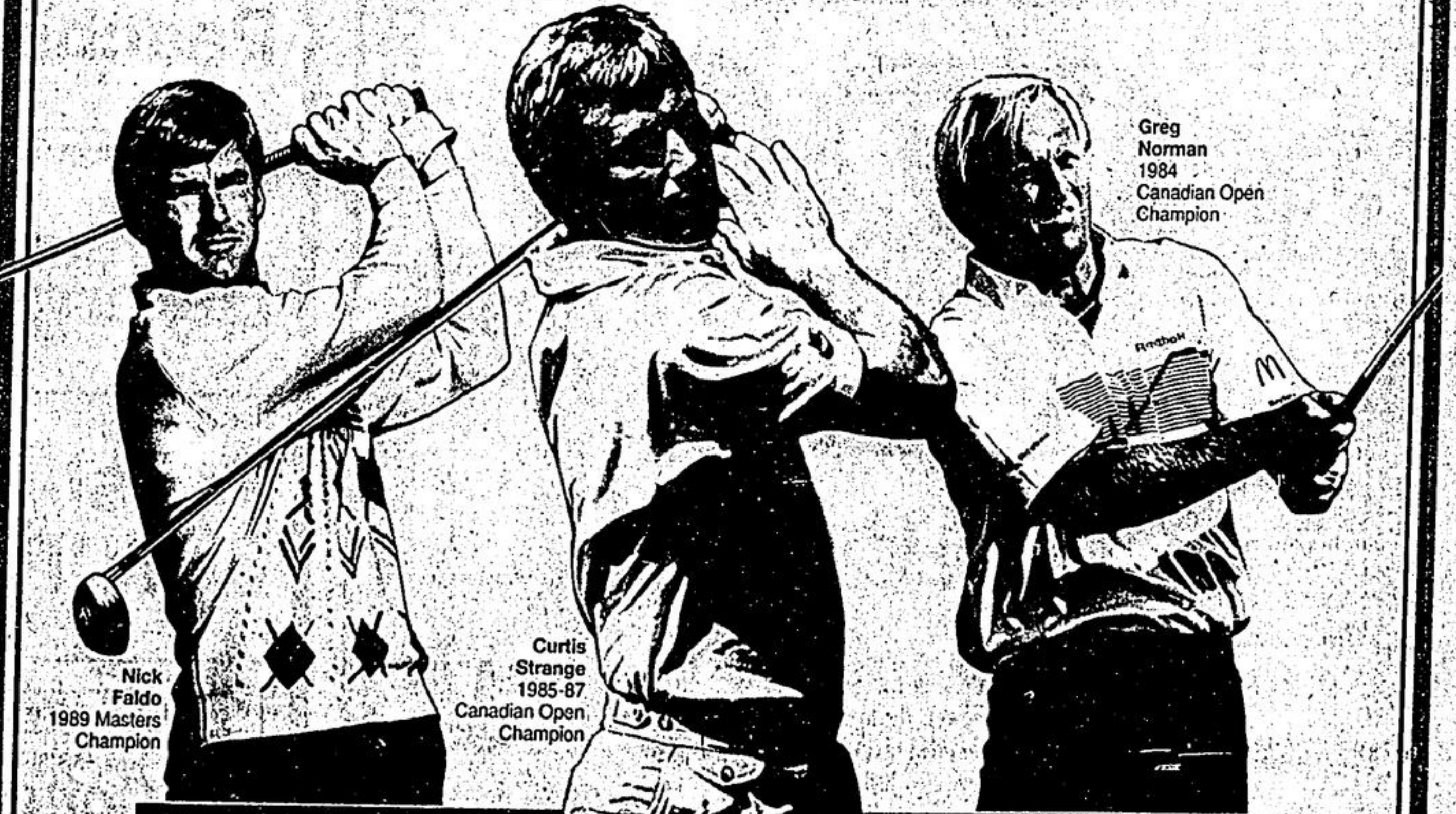
Nick Faldo 1989 Masters Champion

June 19-25 Glen Abbey Golf Club, Oakville