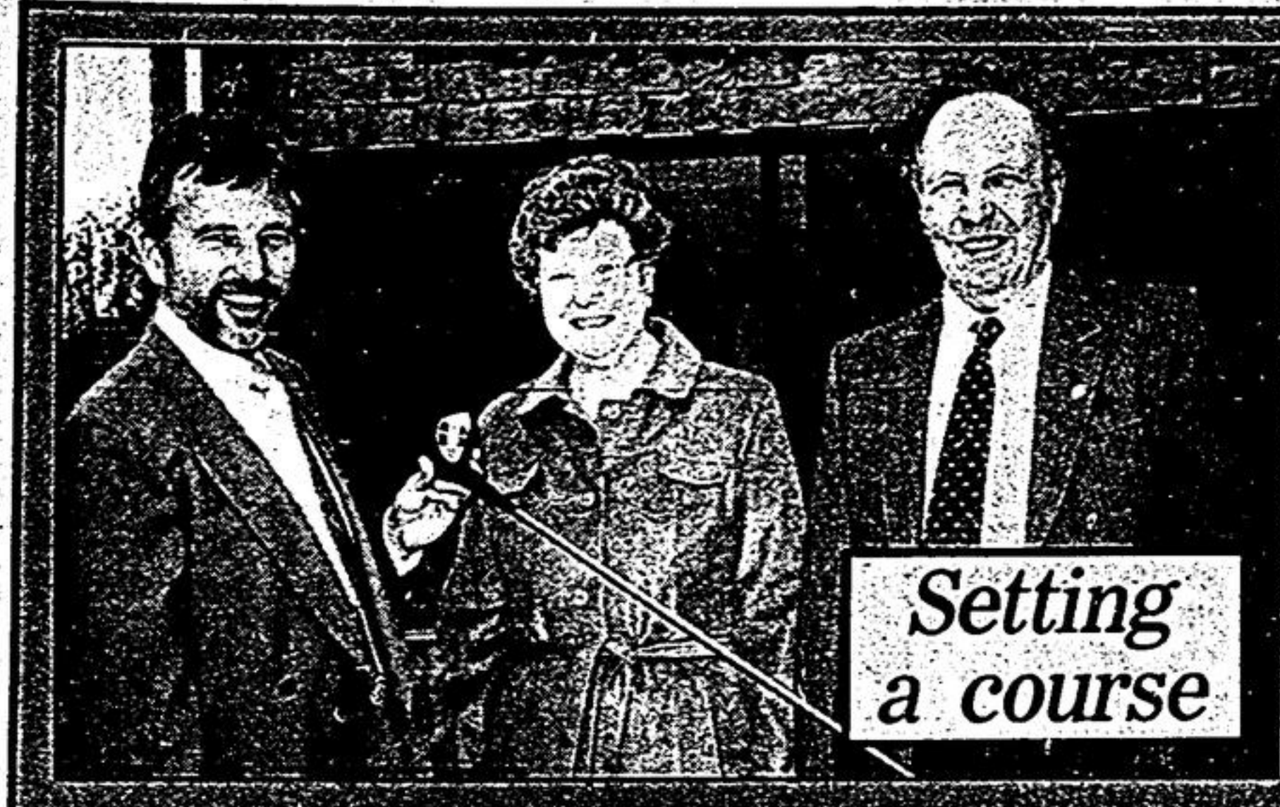
Setting a course