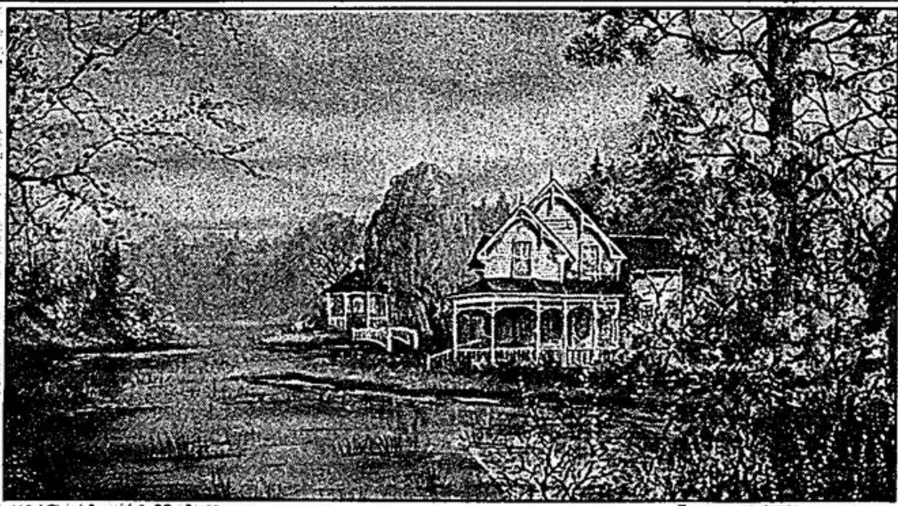
"A Spring Affair"