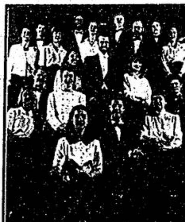
G.F. HANDEL'S MESSIAH

Mail Order Bride Sept. 27 - 30/89 Wingfield's Progress Oct. 25 - 28/89 Centenarian Rhyme Nov. 22 - 25/89