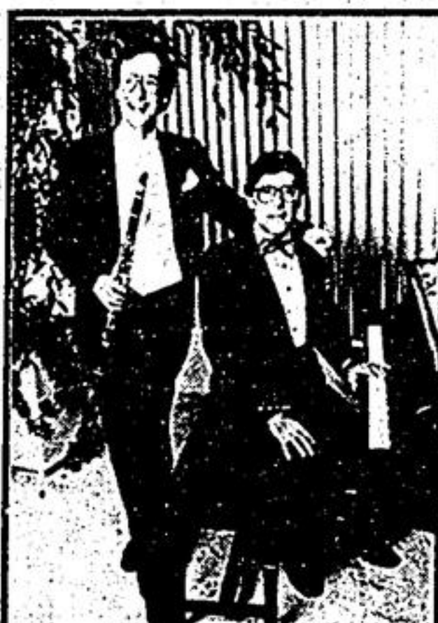
JAZZ IN A CLASSICAL KEY