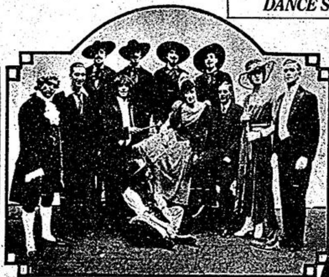
PALM COURT THEATRE ORCHESTRA