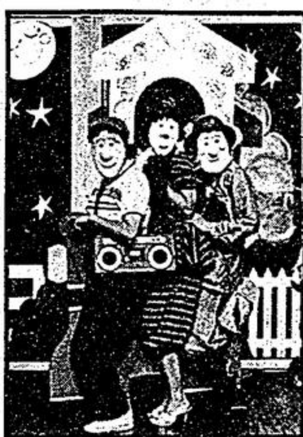
"AT THE BEACH"

Dr. Hook featuring Ray Sawyer Oct. 3, 4/89 Manteca Dec. 19, 20/89 "Janis Joplin, Buried Alive in the Blues" Feb. 6, 7/90 Connie Kaldor March 23, 24/90