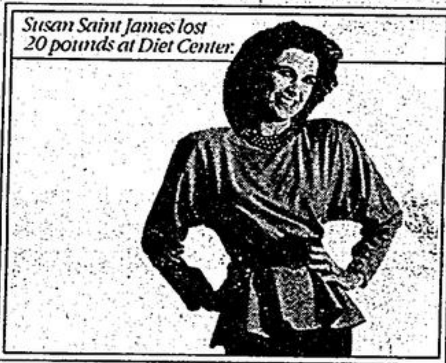
Weight loss and speed of loss vary with each individual. © 1989 Diet Center, Inc.

Call today for a free introductory consultation!