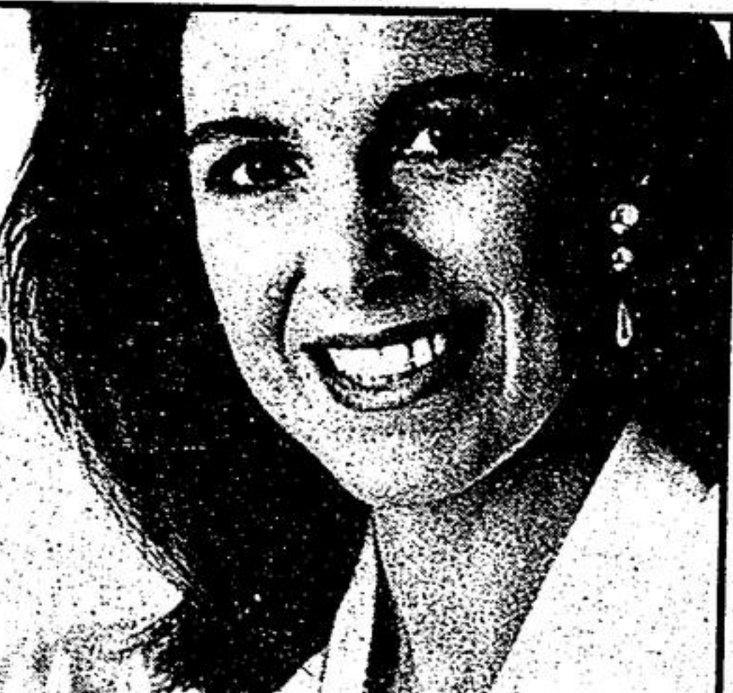
Susan Saint James Susan Saint James, actress, mother and Diet Center success story.

Having my fourth baby was a snap, but losing the weight afterwards was tough. That's why I went to Diet Center. They helped me lose weight fast by eating real food — none of that gimmicky stuff. It was a terrific programme. I talked my mother into joining with me, and she lost 25 pounds. Here's why you should join Diet Center: ■ Lose fat, not muscle. Research shows 92% of the weight lost on the Diet Center