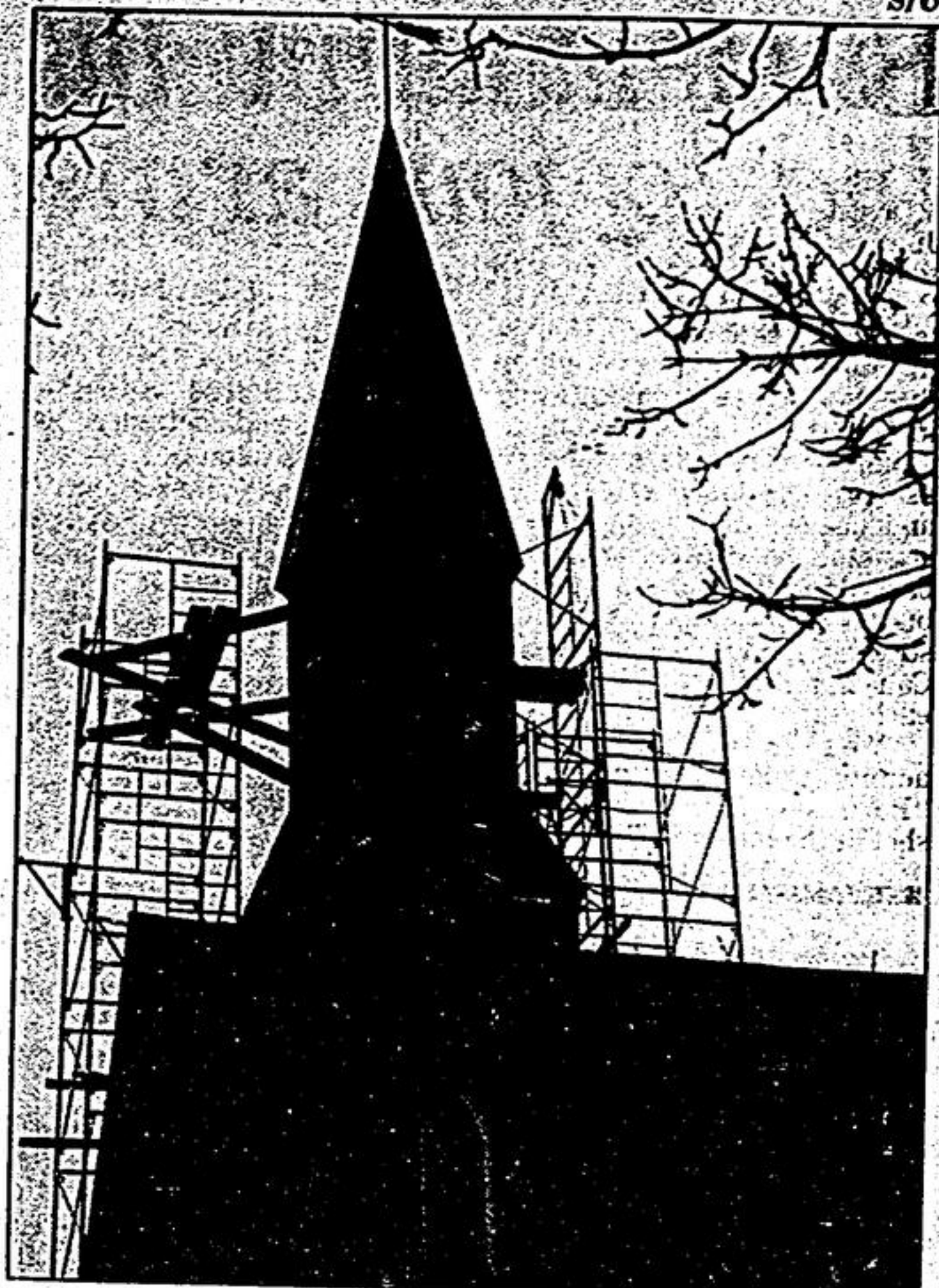
Work is underway to restore Melville United Church to its original architectural beauty. Members of the congregation and community have taken the lead in fundraising to see the project through.