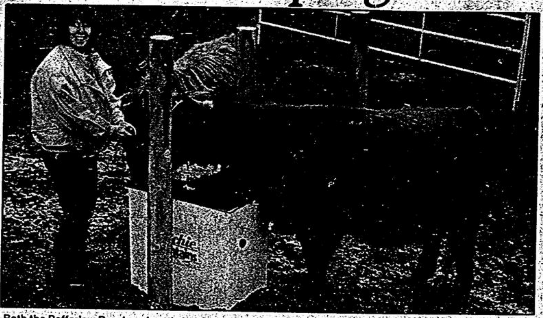
Both the Pefferlaw Brook and cattle belonging to Uxbridge farmer Mike Macbeth (above) benefited from a program sponsored by the Lake Simcoe Region Conservation Authority. The Highland cows are less likely to pollute the stream and trout will be able to continue breeding there with a controlled access point on Mike's land.

Brian's suggestion, during a site visit, included fencing the stream to restrict cattle access. Cattle could water there at a con-