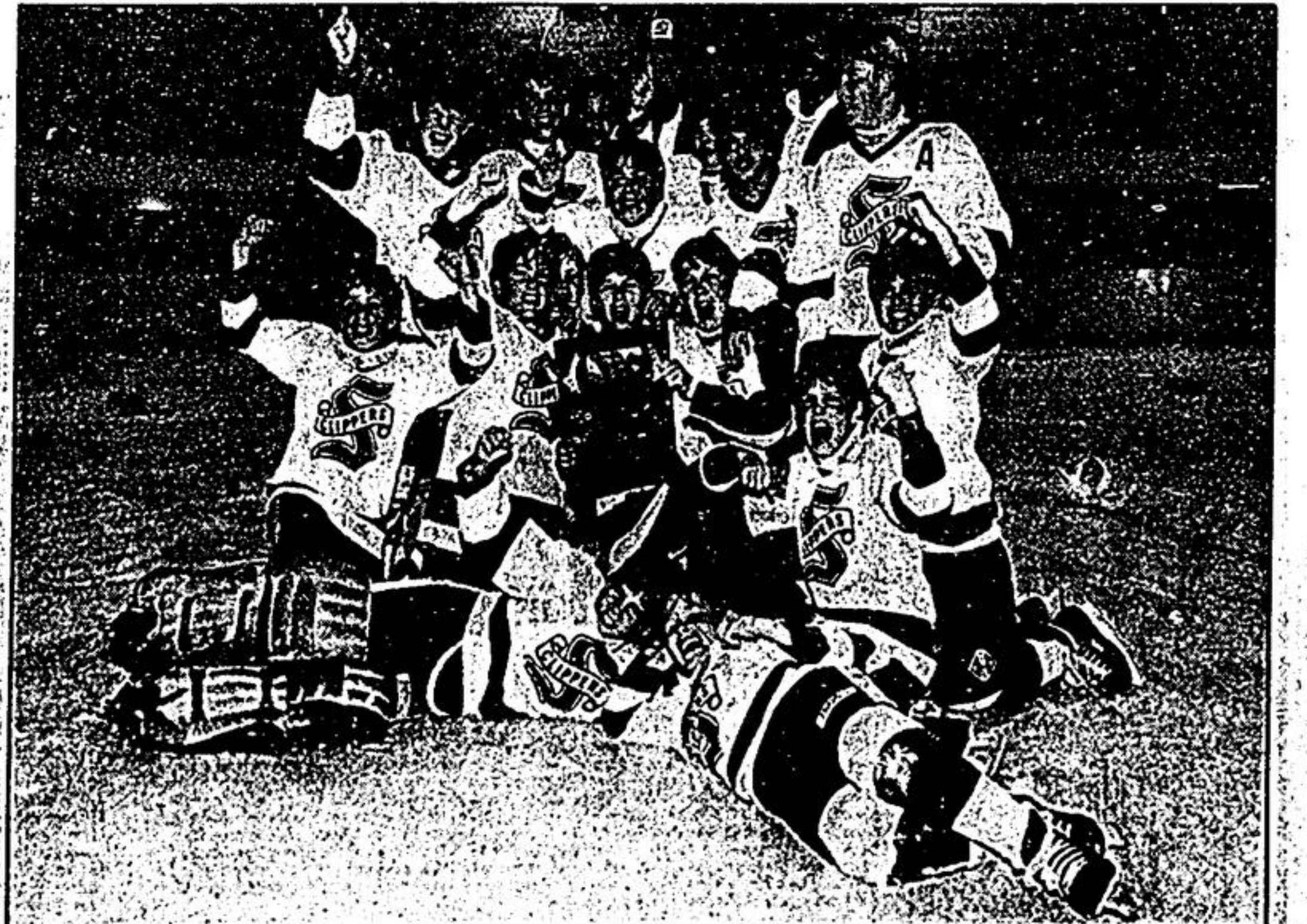
The Fame International Atom Clippers won the Ontario championship in fine style last April with a three-game sweep of Hespeler. Although the Stouffville squad won the series, the locals only managed to sneak by Hespeler 2-1 in the final contest.