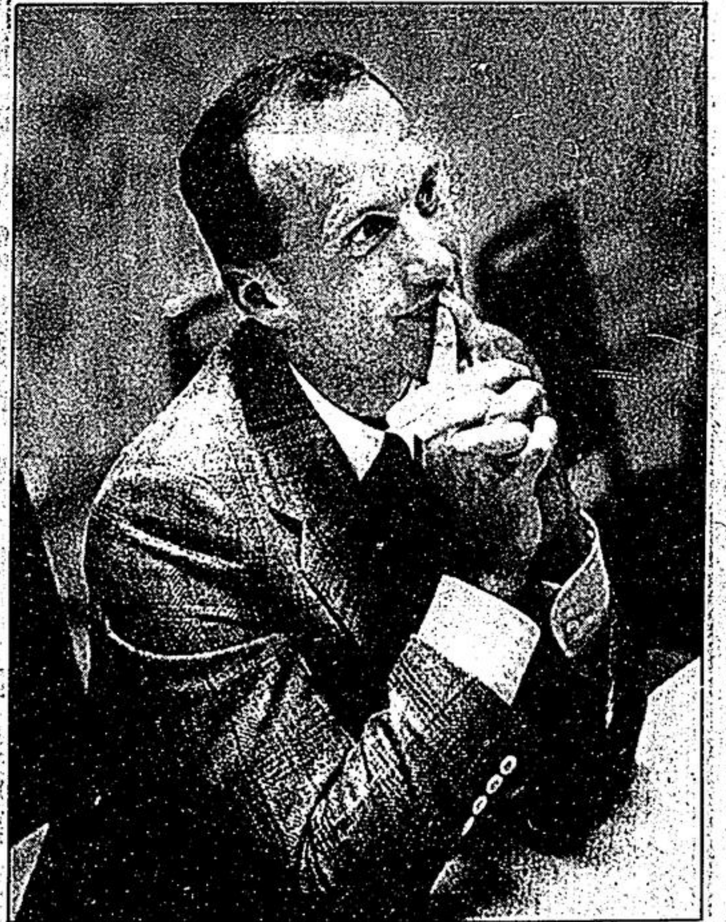
Stouffville's Kelth Acton, a member of the Stanley Cup winning Edmonton Oilers, was honored at a roast in Town last June. Acton has also seen action with the Minnesota North Stars and the Montreal Canadiens.