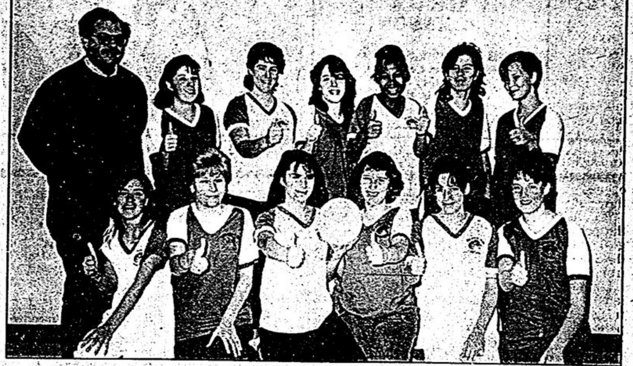
TOP TEAM: The Orchard Park school girls volleyball team are the reigning Area 'F' champions of the sport. The girls trounced all competition last week in their bid to be the best in the area.