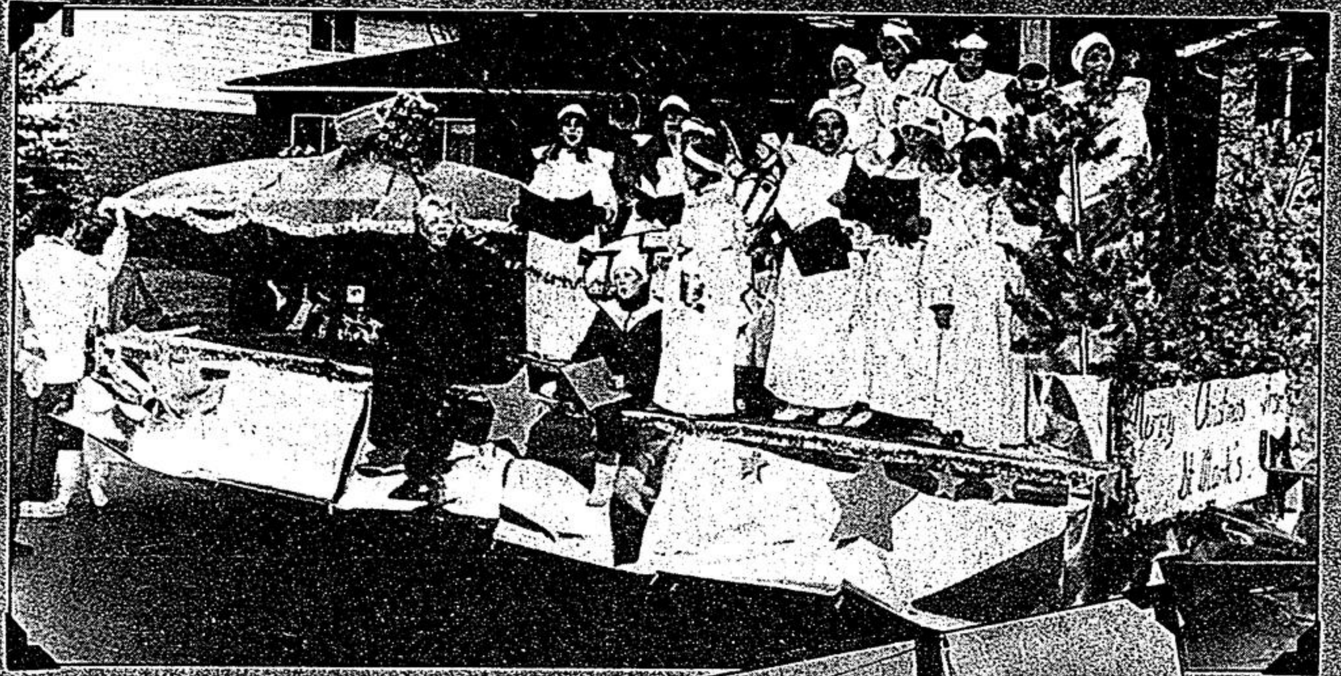
The star of the show, Santa Claus, lit up the faces of children along the parade route at the Stouffville Santa Claus parade. At right, students at St. Mark's school became the Marlian Tabernacle Choir for the parade. Their float won the award for most original entry. Christmas in the future was the theme of this year's parade.