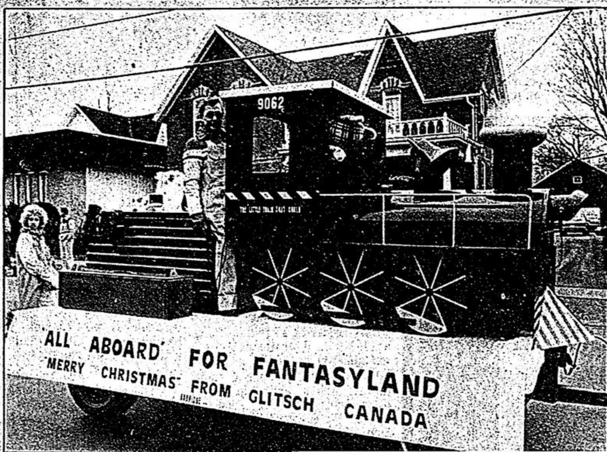
The Fantasyland train was a novel highlight of the Uxbridge Santa Claus parade.