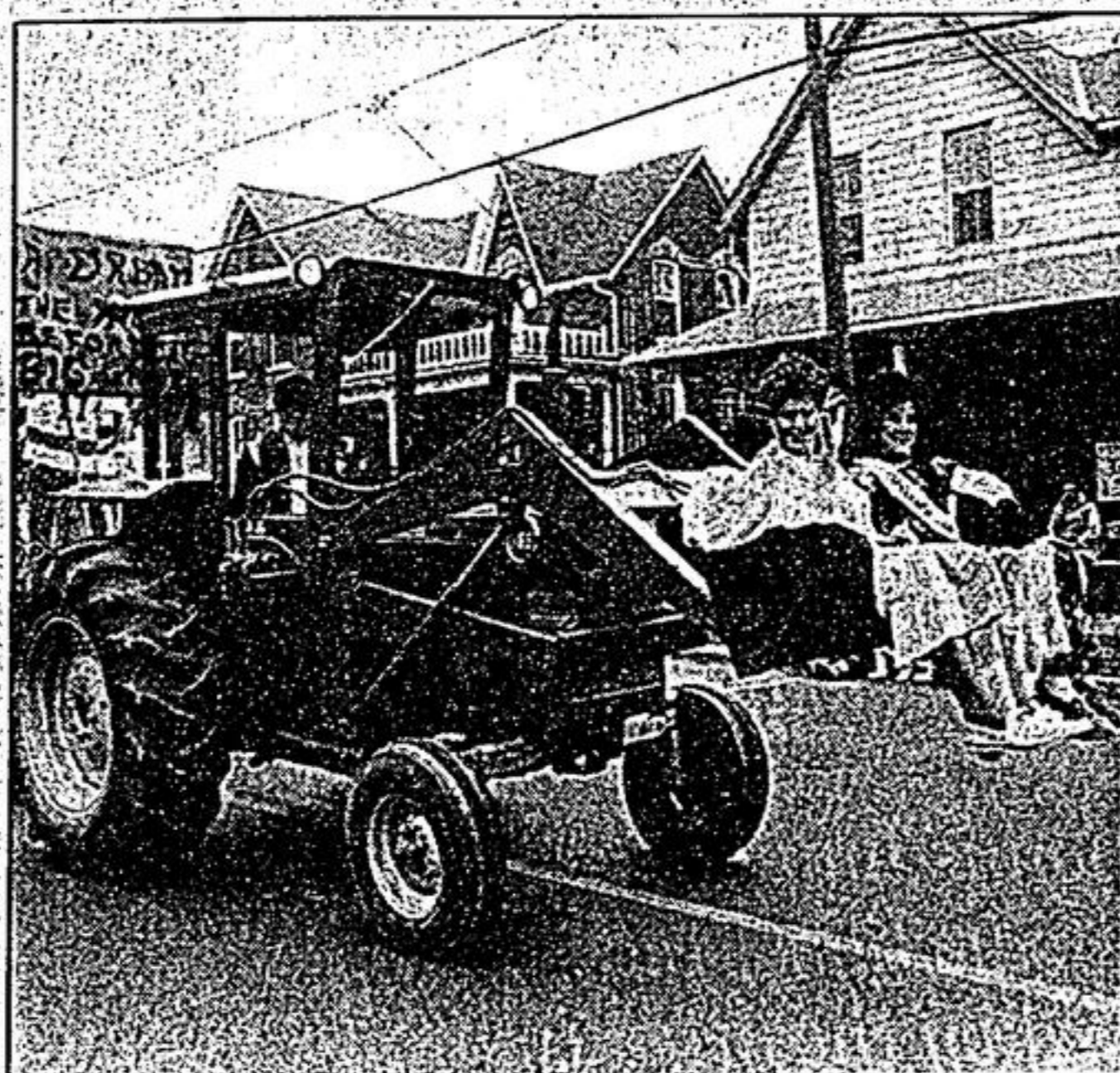
The bucket of this loader made a handy seat for two participants in the Uxbridge Santa Claus Parade.