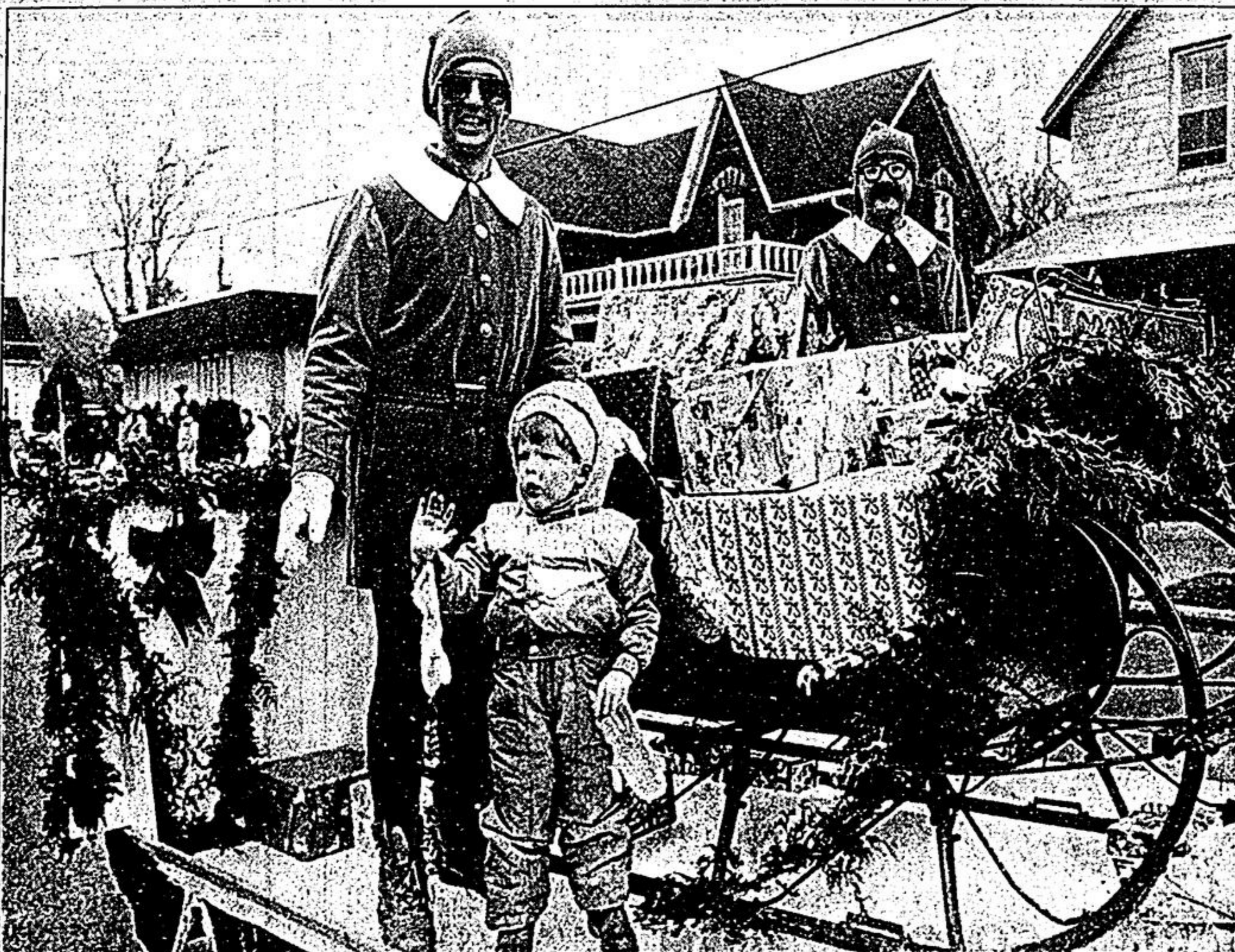
A sleigh filled with gifts for good girls and boys was guarded by these two elves and their junior supervisor.