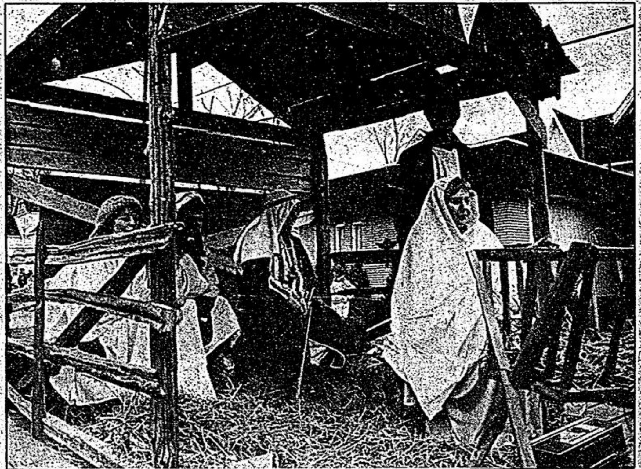
A manger scene float provided a reminder of the Saturday on Uxbridge's Brock St. real reason for Christmas at the parade, held