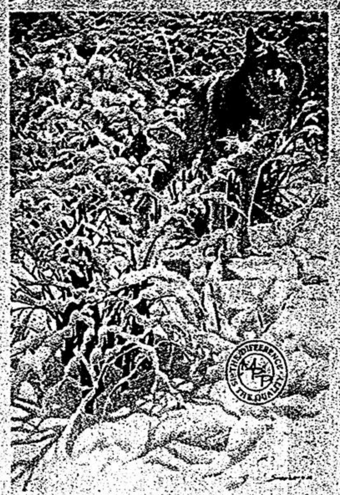
"Winter Spirit - Gray Wolf" 19" x 29"

Internationally Famous Wildlife Artist on Sunday, November 13th (1-5 p.m.) (slide presentation - 3 p.m.) Original Oils and Limited Edition Prints