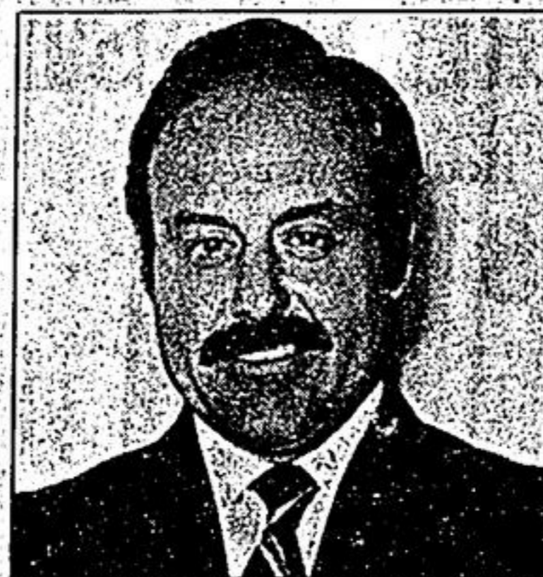
NICK TATONE Photo Courtesy Stouffville Sun