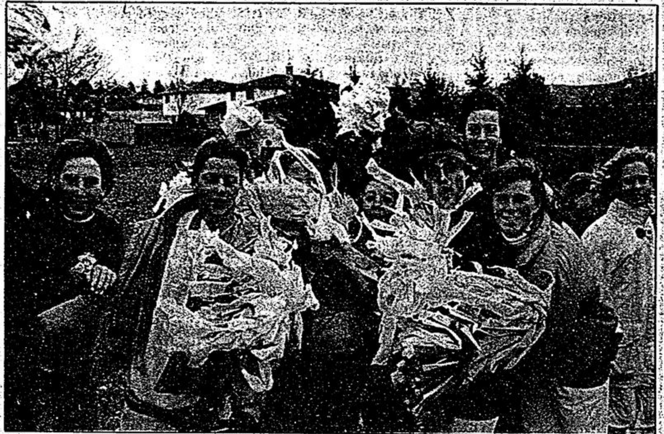
CHEERS: The students of Grade 7 at Summerview Public School cheered on their Junior Intermediate flag football team as they tackled a teacher all star squad. They had plenty to cheer about, even though the teachers were mean enough to steal a 28-7 victory away from the youngsters, Friday.

The Atoms play at Cobourg this Friday, then come back to the Recreation Centre to host Port Hope on Nov. 9 at 7 p.m.