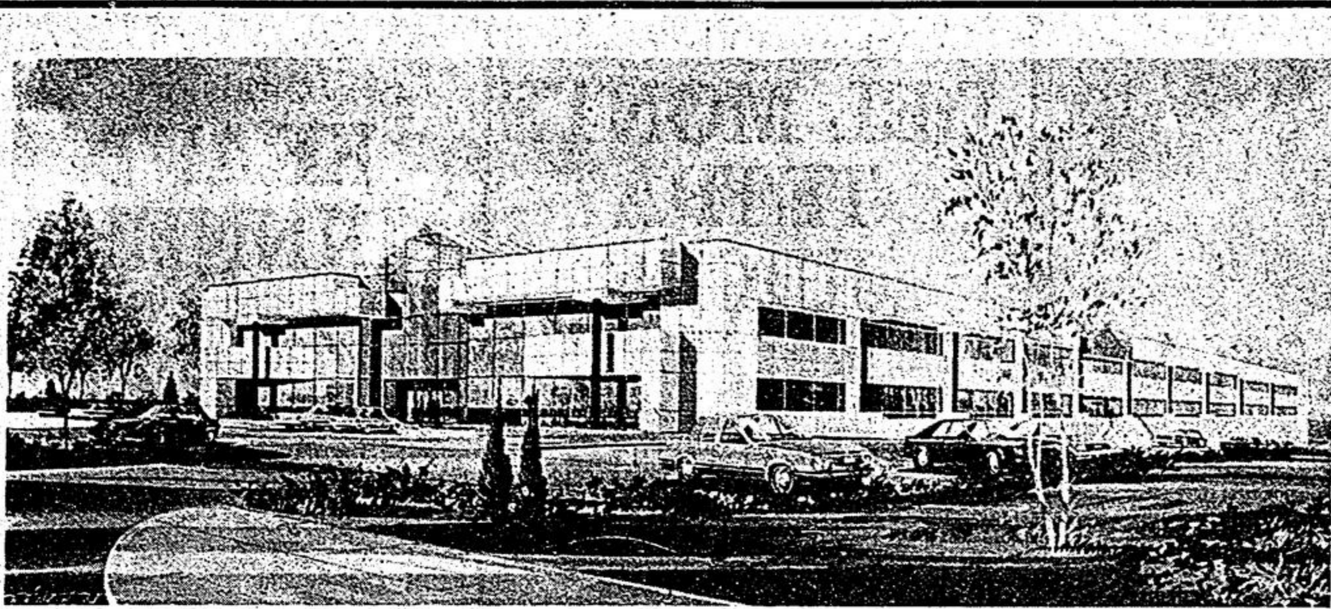
GLENELLEN OFFICE BUILDING, WOODBINE AVE. NORTH OF HIGHWAY #7, MARKHAM, ONTARIO