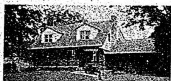
FAMILY HOME ON 1 ACRE $379,900

852-3443 640-2082 Toronto Line 294-1372 ext. 243