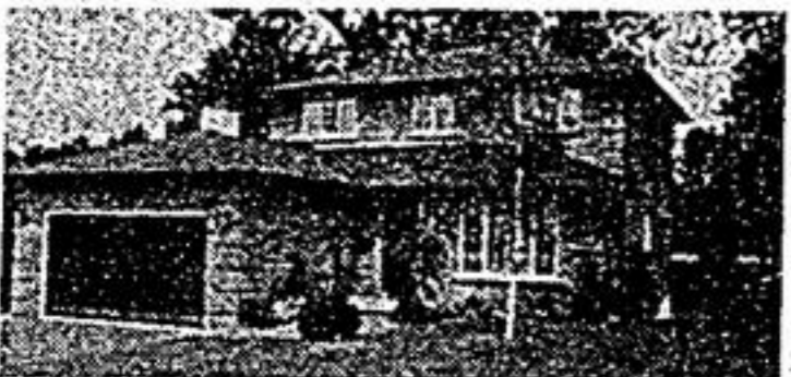
IMMACULATE TESTA HEIGHTS

Mins. to Uxbridge in a charming country setting. Inground pool and small barn. Just a few of the many features. Sherry O'Neill 294-1372.