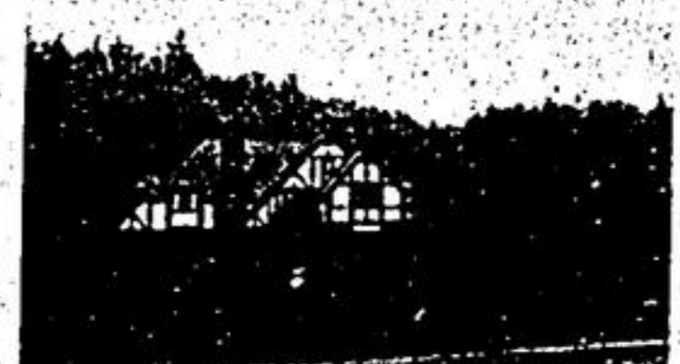
JUST NORTH OF MARKHAM

A palatial 5 bedroom home on a beautiful, tree, 2 acre estate lot. Every conceivable luxury feature has been included. Please call Grant Burns, 245-5544 - Voice Pager 5199 - Homelife Bayview Realty, Realtor, 889-2200.