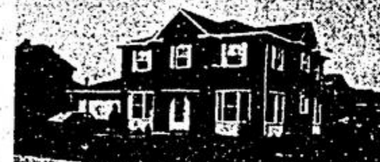
"NOT A HOUSE BUT A HOME"

4 Bedrooms on oversized landscaped lot. Features tender loving care. Home is immaculate, decorated like a model and has central air and central vac., plus upgraded broadloom. Feel the difference good taste can make. Call me for details on this home. Larry J. Guimond, Re/Max Realty Plus Inc., 683-2992 or RES. 686-2665.