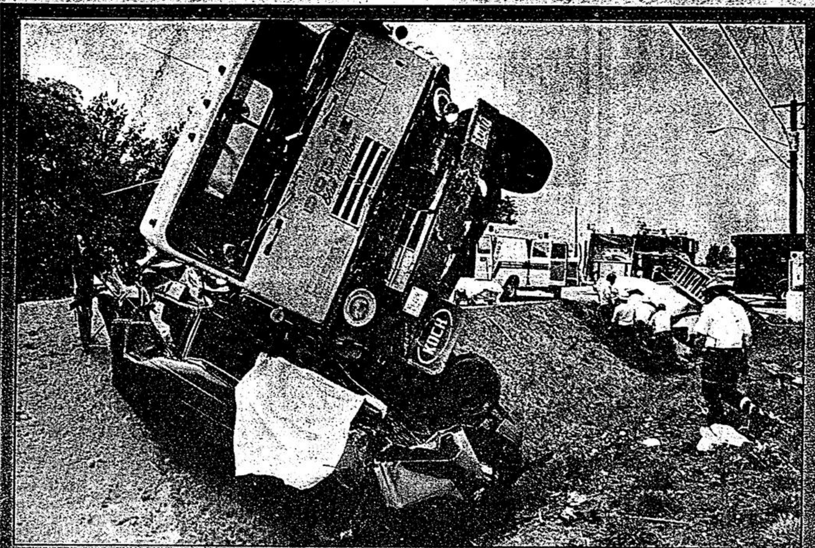
A Brougham woman died in the crumpled wreckage of her Plymouth Voyager minivan Monday following collision with a southbound gravel truck on the Brock Road north of Concord. A third vehicle was also involved but the driver escaped serious injury. —Kevin Hann