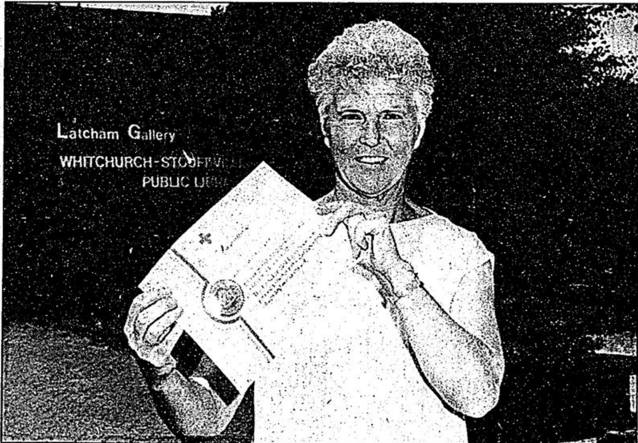
Super blood donor praises Legion Ladies