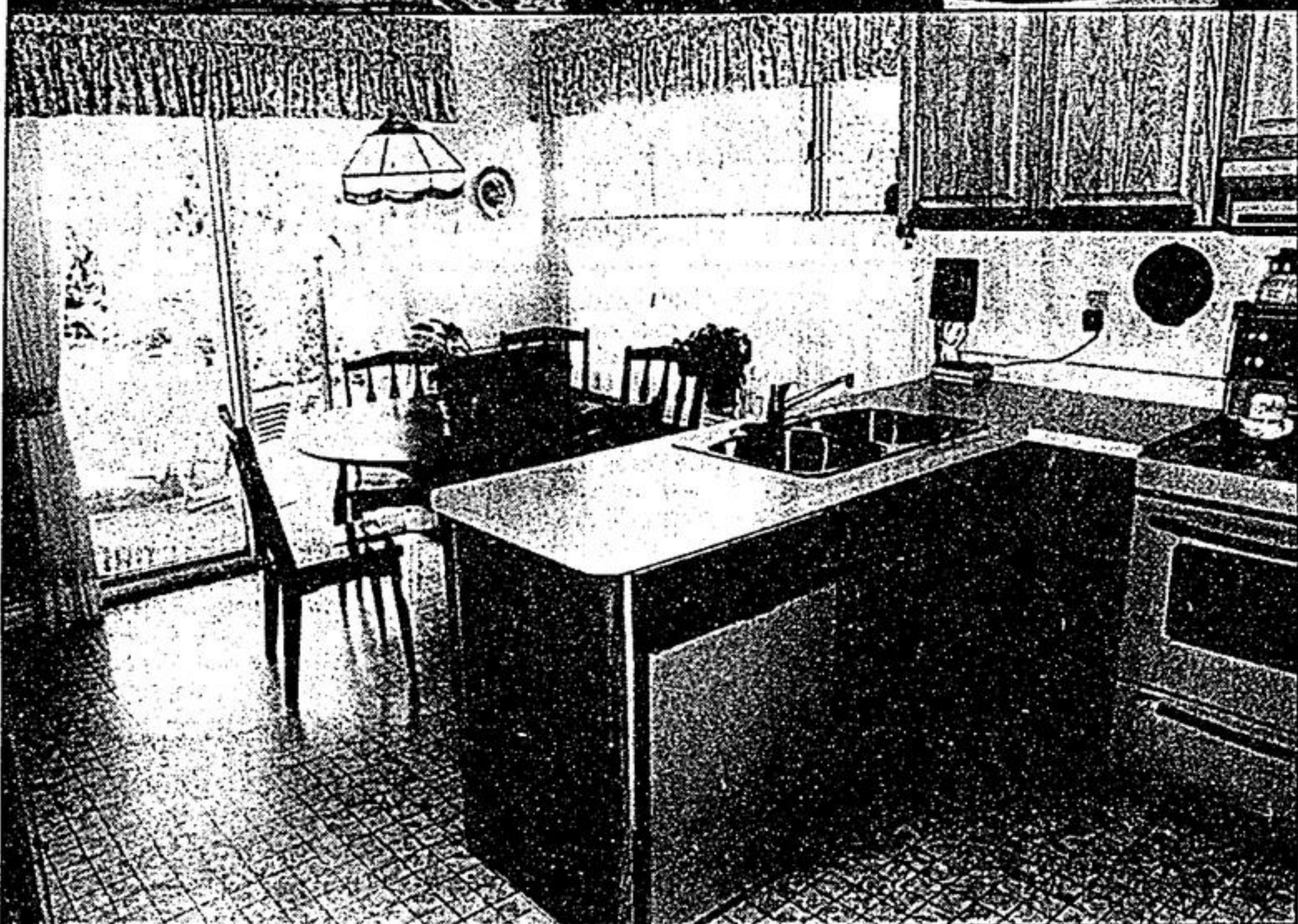
Home of the week