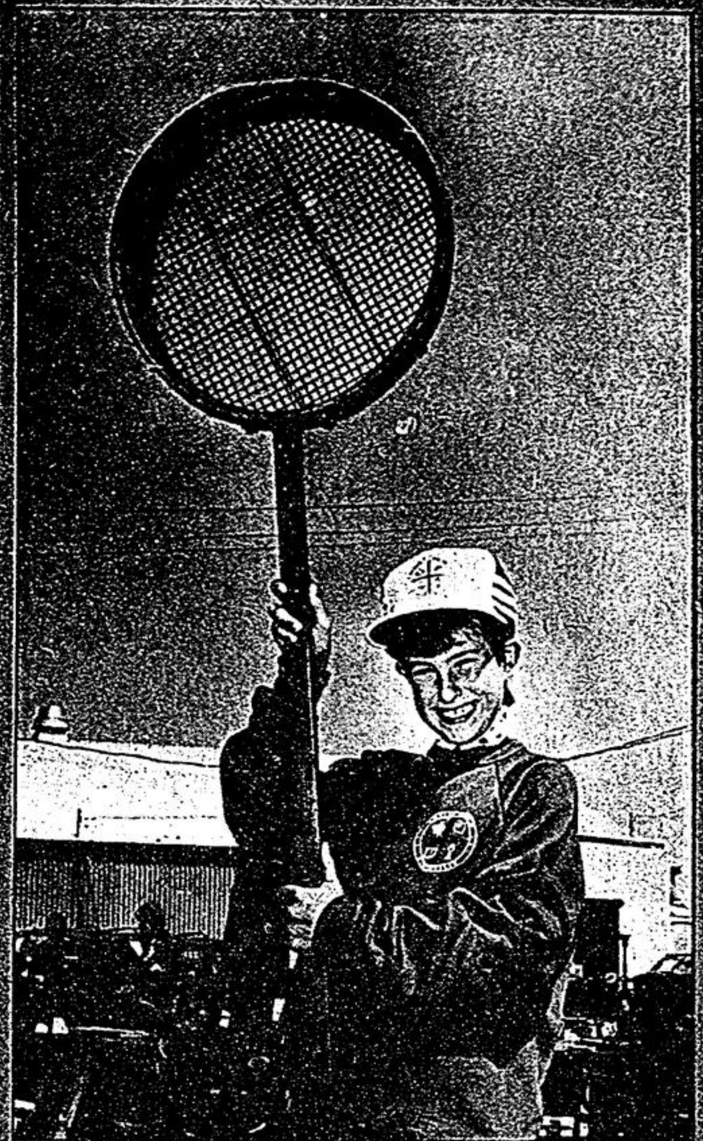
(right), also of Maystone Court, with a unique ash sifter valued at $57.50.