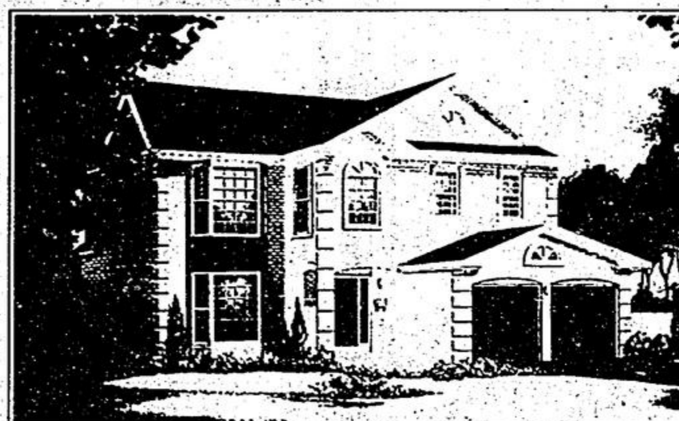
The Stratford 2990 sq. ft.