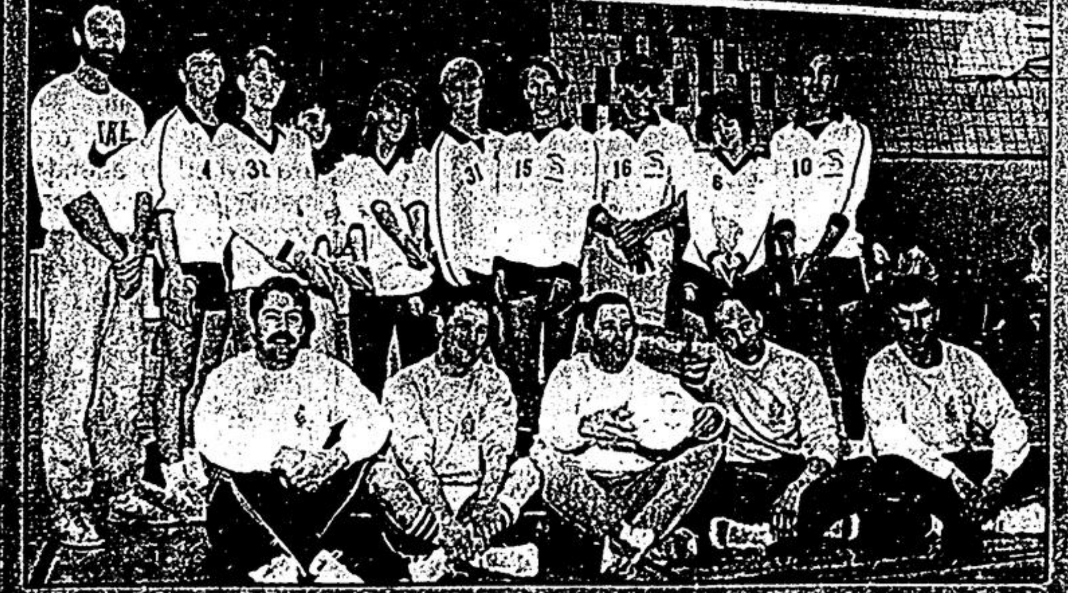
The York Region Police Community Service Bureau used against a mixed squad of SDSS volleyballers could best be described as brutal. Money raised will be used to fund tee-shirts, awards and the year-end athletic banquet.