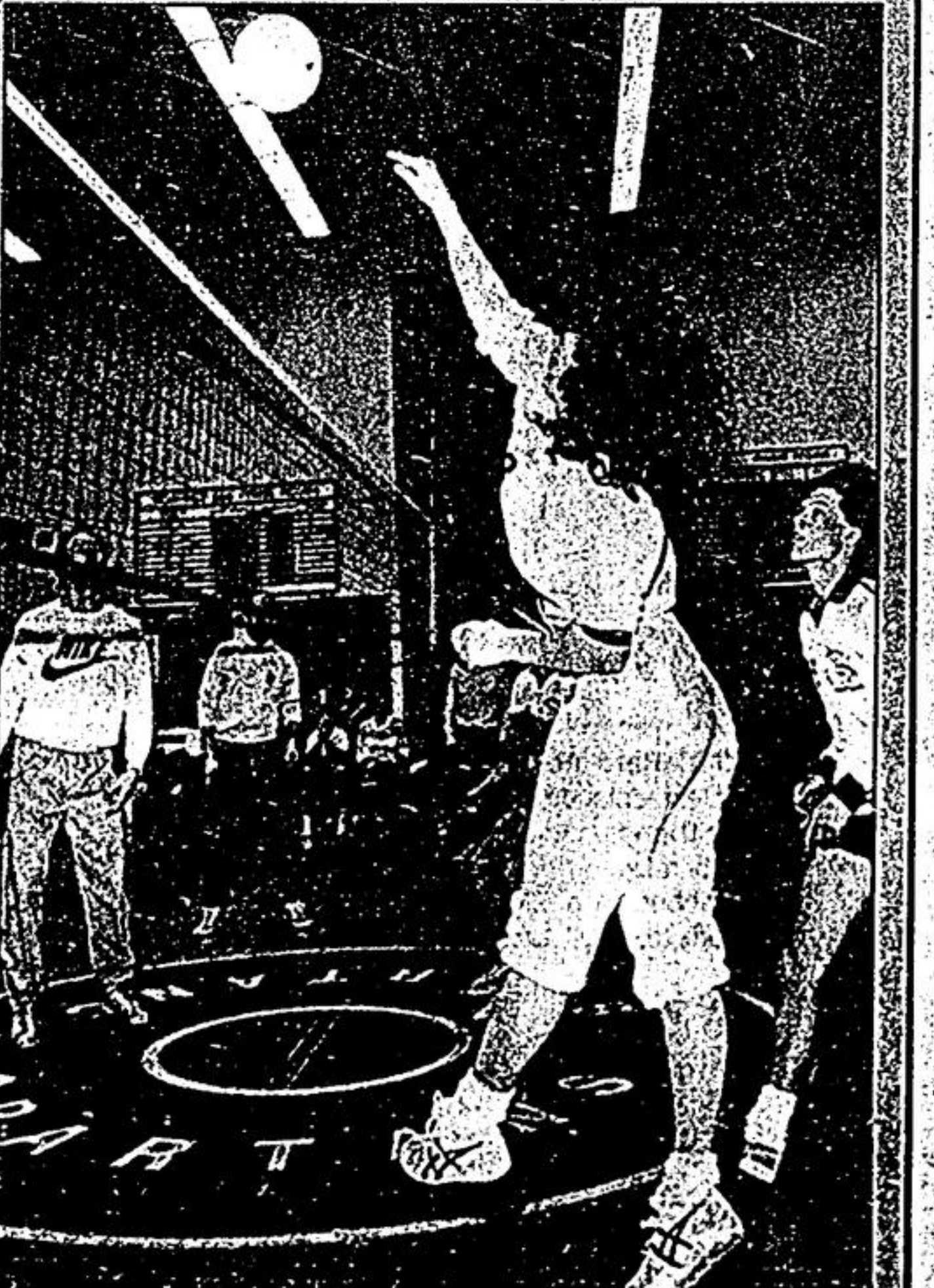
Whatever the method it did not work (though it kept the crowd of about 250 students on their toes as they fielded errant volleyball).