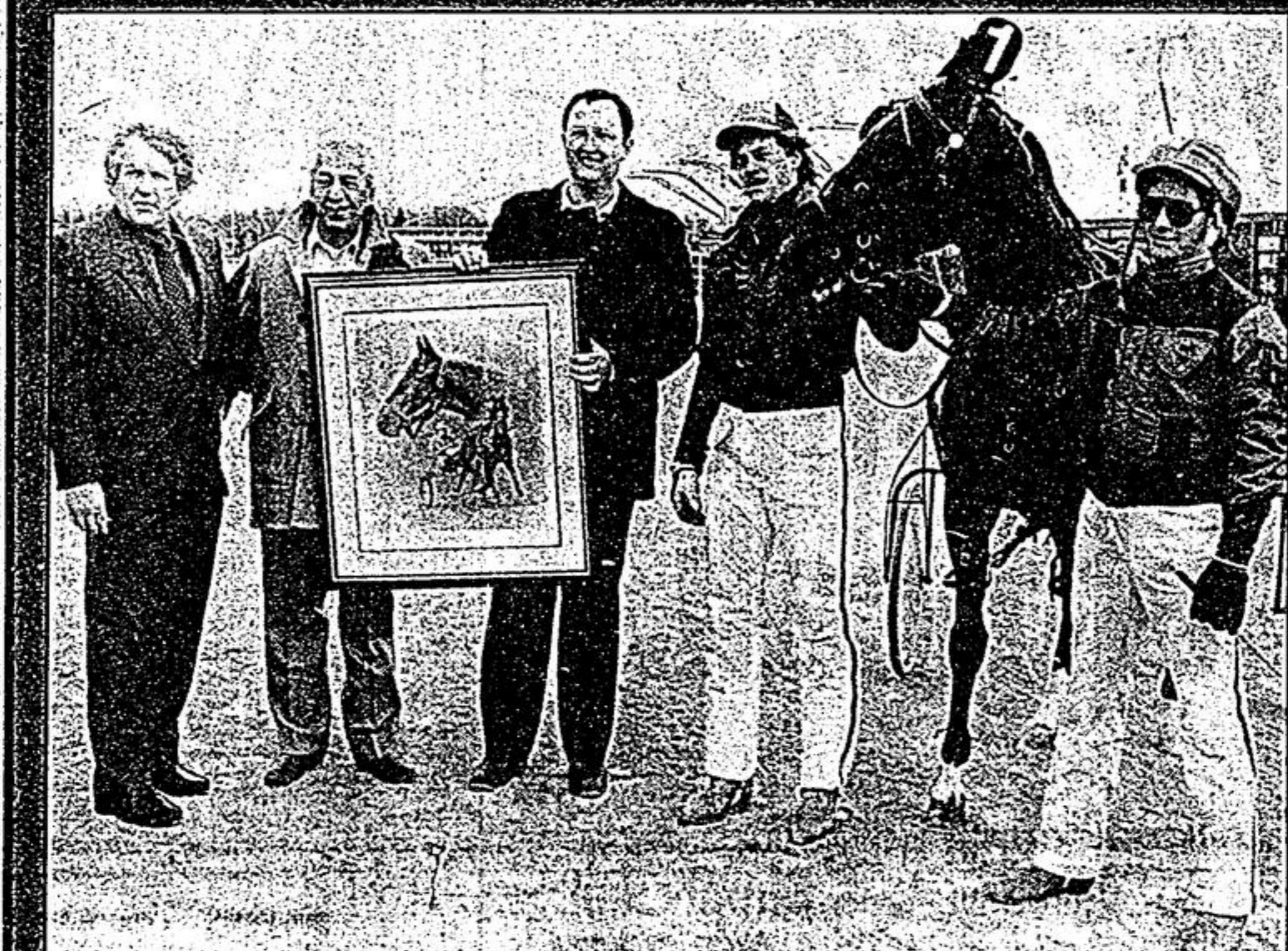
In the Sport of Kings, you can't win 'em all.