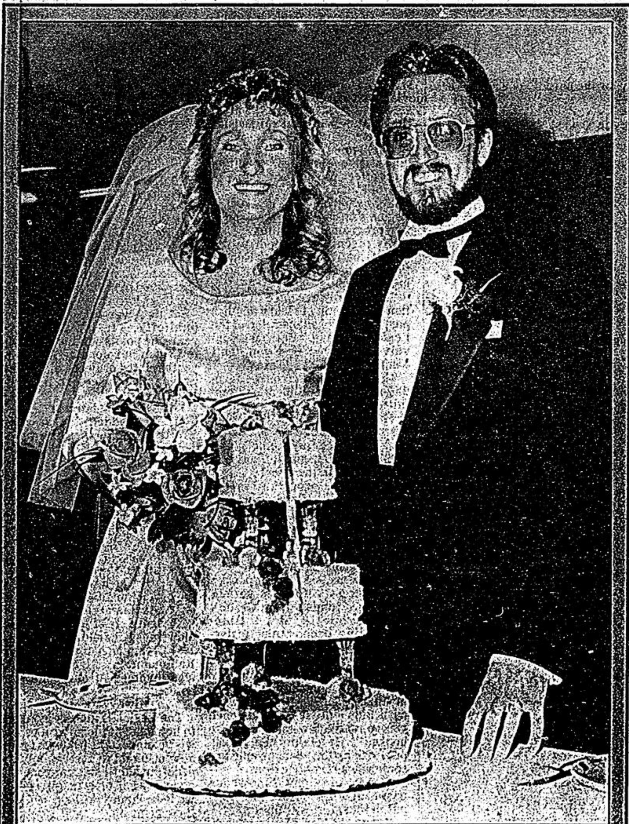
Bride wore mother's wedding dress of 38 years ago