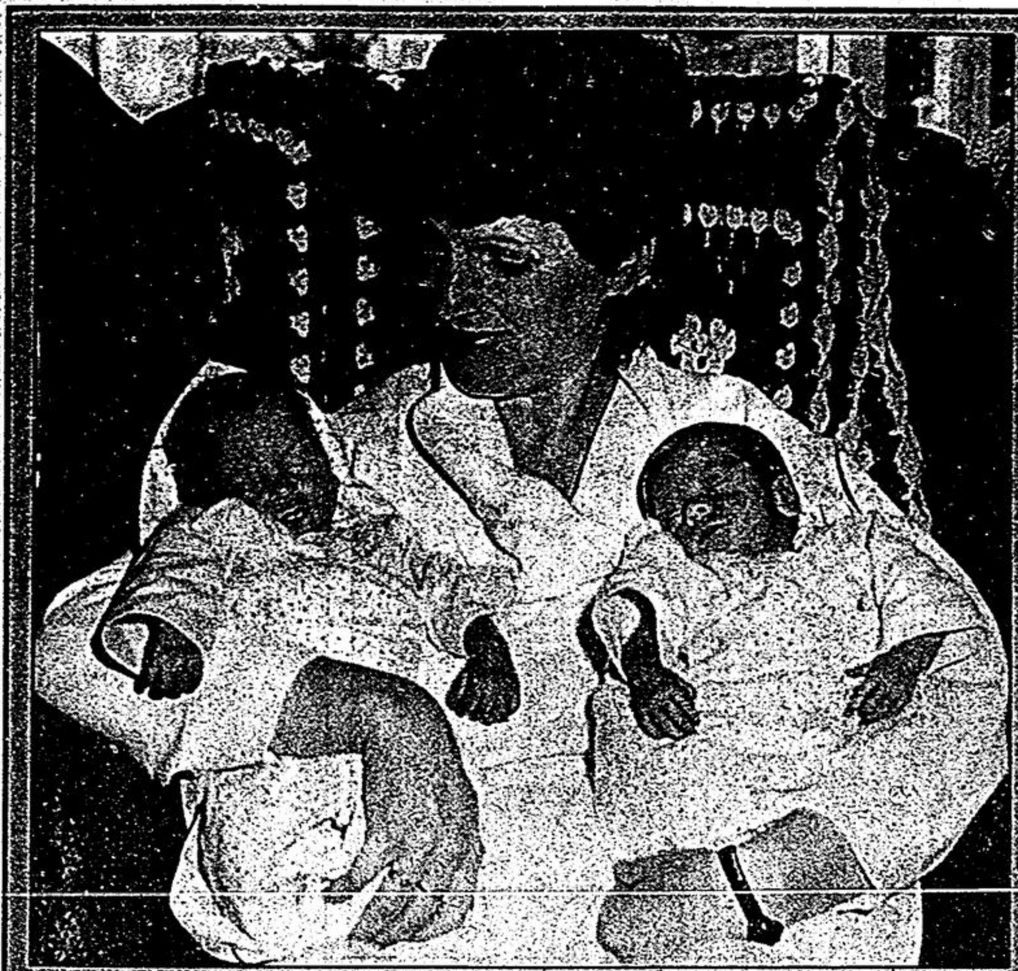
Family of three is now five