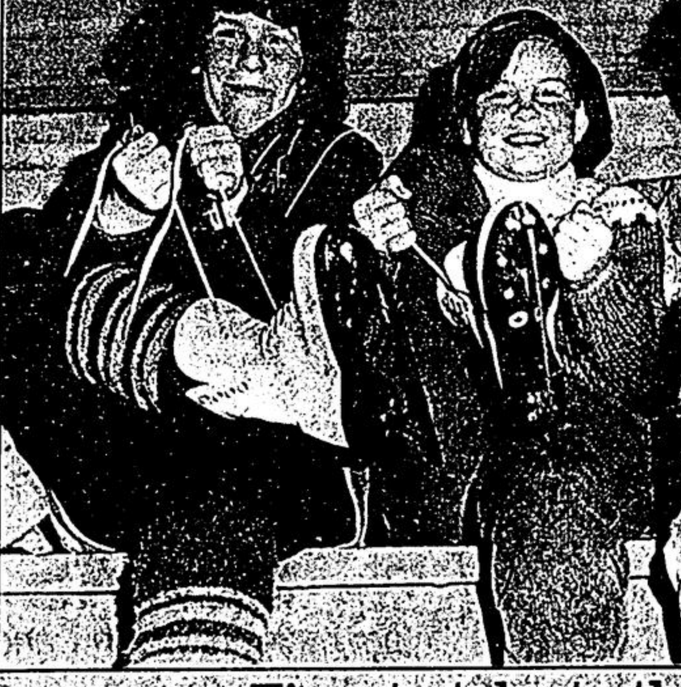
Time to take to the ice The Whitechurch-Stouffville Rec. Centre was a busy place Friday. In the morning, free skating was provided by the Christian Education Department of St. James Presbyterian Church. In the afternoon, the