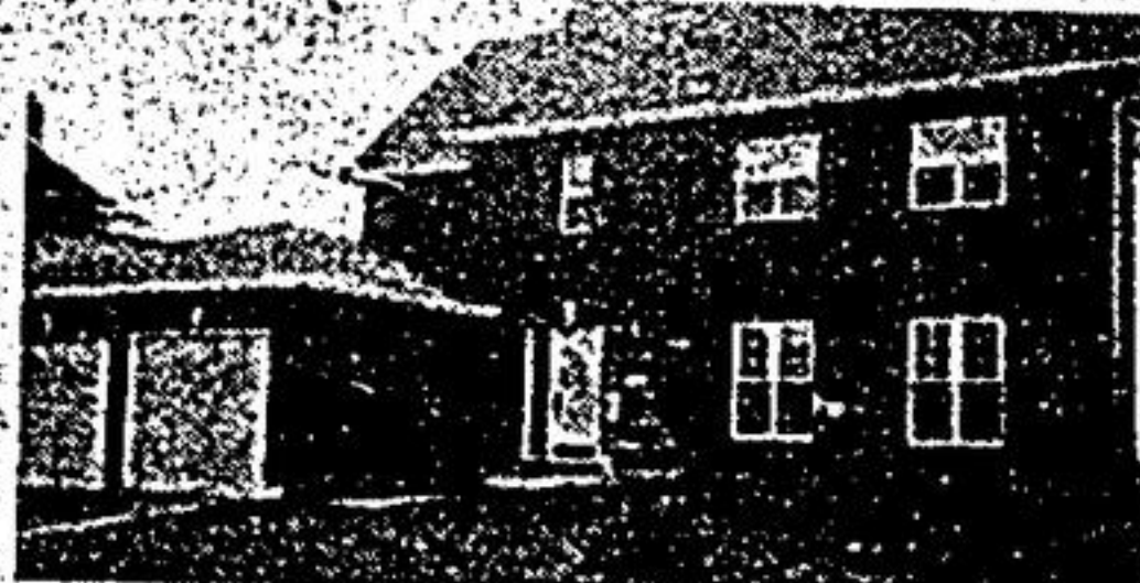
3300 SQ. FT. IN STOUFFVILLE