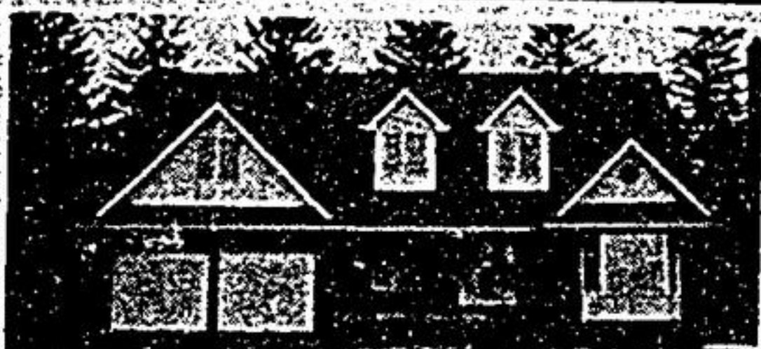
CAPE COD IN STOUFFVILLE