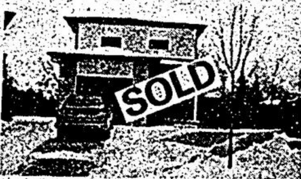
PRIDE OF OWNERSHIP