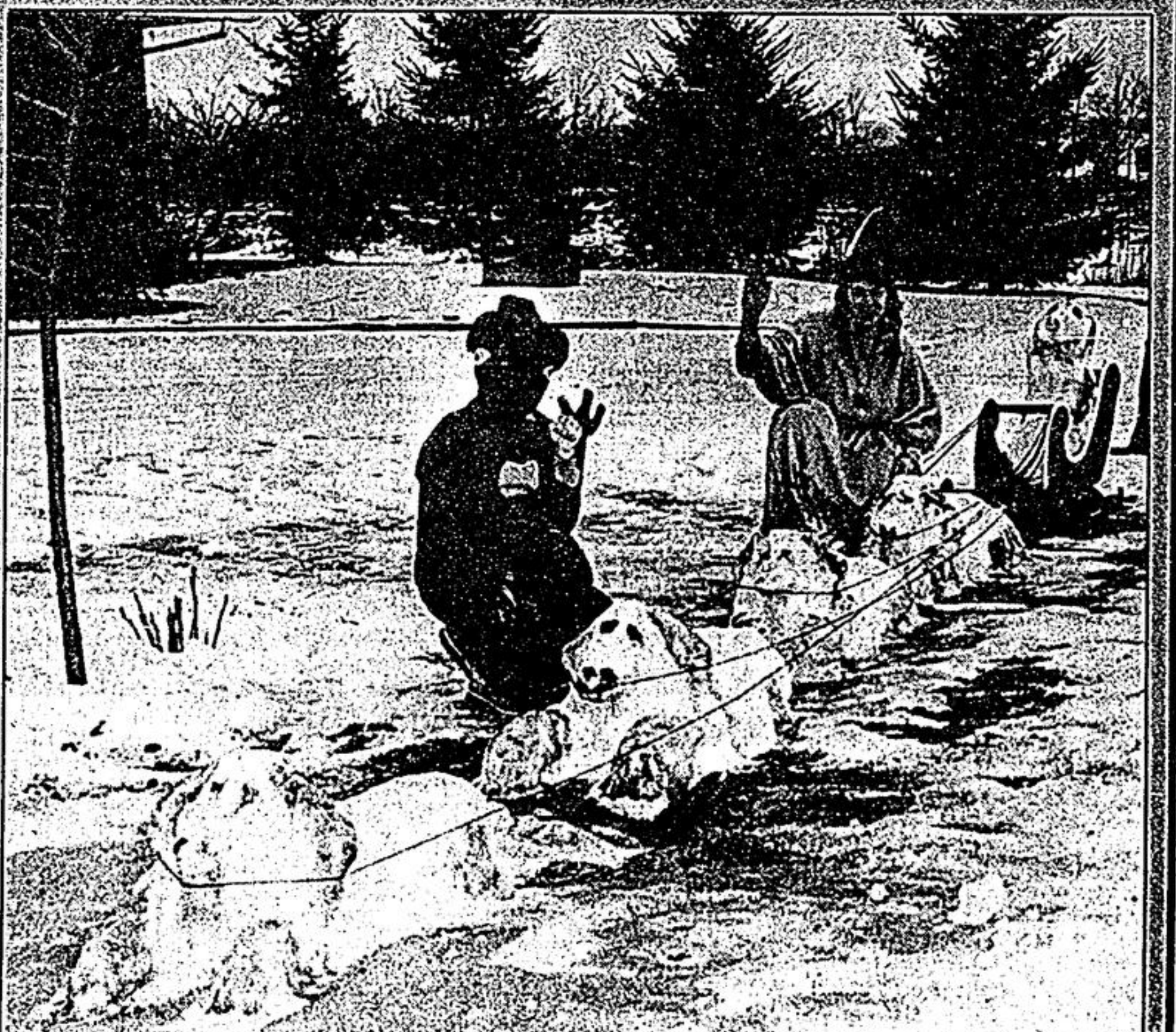
Kirstin and Sean Nagy of Claremont won a third prize in the Snow Sculpture Contest. Unusually mild temperatures prompted the judges to speed up their work before the projects disappeared.