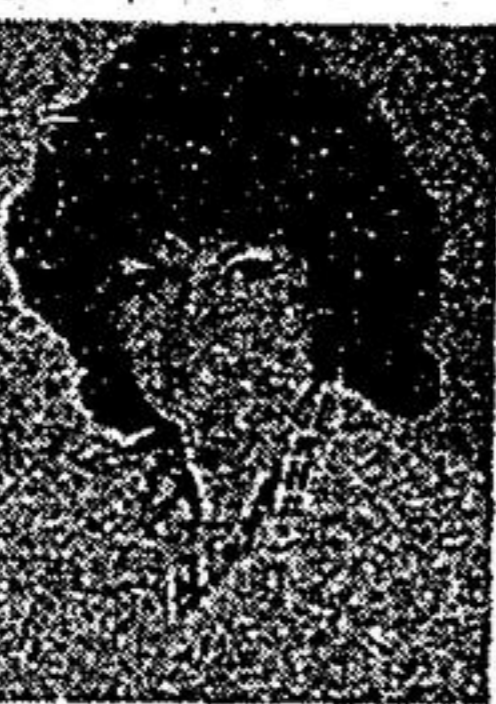
MARGO GREENAWAY RES. 473-2546

Good investment or build your retreat home. 14 acres. $30,000. Just east of Kirkfield. Call Margo Greenaway 640-3131 or 473-1979.