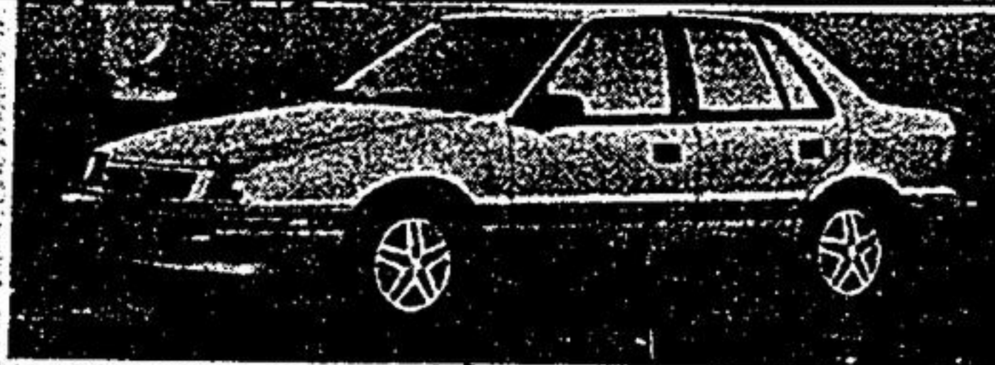
1988 SHADOW 4 Dr./2 Dr.

Air, auto, P.S./P.B., stereo, tilt, cruise, p. window, p. lock, p. mirrors, dual mirrors, tinted glass, 2.5L engine etc.