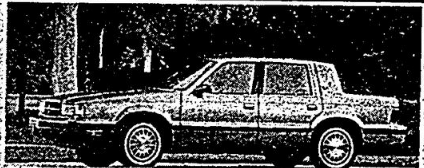
1988 DYNASTY 4 Dr.

Air, auto, P.S., P.B., stereo, dual mirrors, tinted glass, 2.5L engine etc.