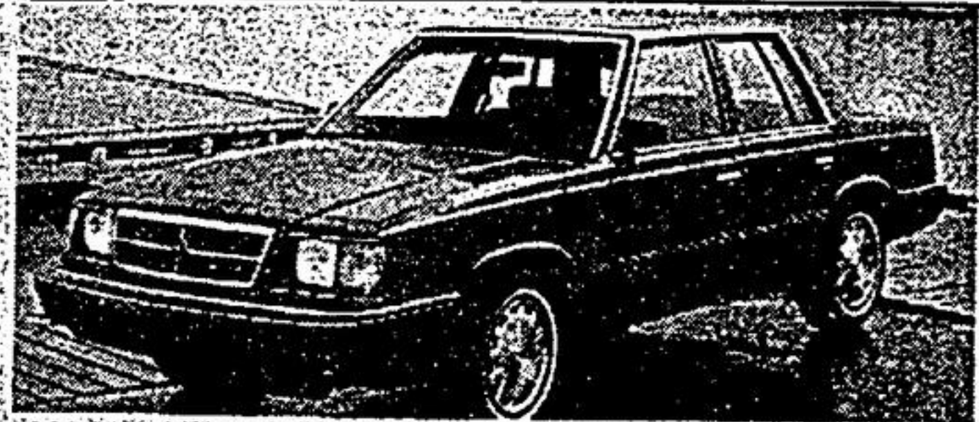
1988 ARIES L.E. 4 Dr./2 Dr.

Air, auto, P.S., P.B., stereo, dual mirrors, tinted glass, 2.5 L engine etc.