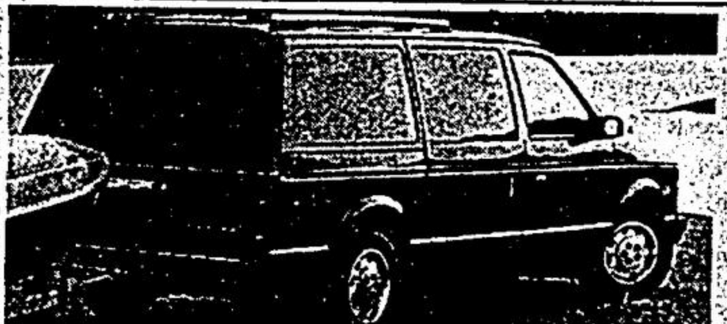
1988 CARAVAN S.E.

3.0 L, auto, P.S./P.B., 7 pass, air, h.d. suspension etc.