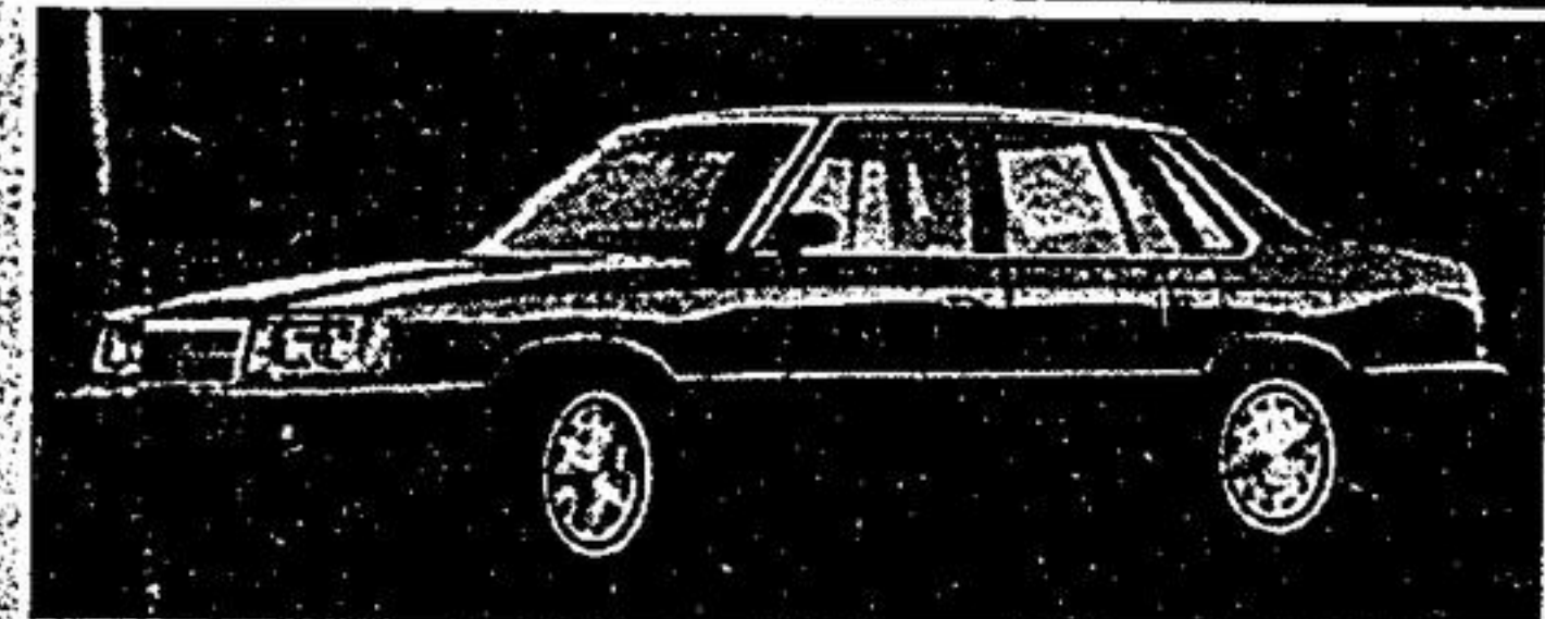
1988 600 4 Dr.

Air, auto, P.S./P.B., stereo, dual mirrors, tinted glass, 2.5L engine etc.