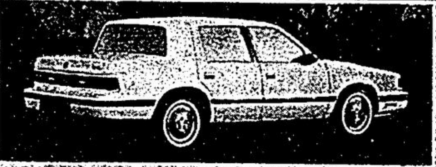
1988 DYNASTY PREM 4 Dr.

3.0 L engine, air, auto, P.S./P.B., cass., tilt, cruise, p. seat, p. mirror, p. antenna, wire wheels, ill. entry.