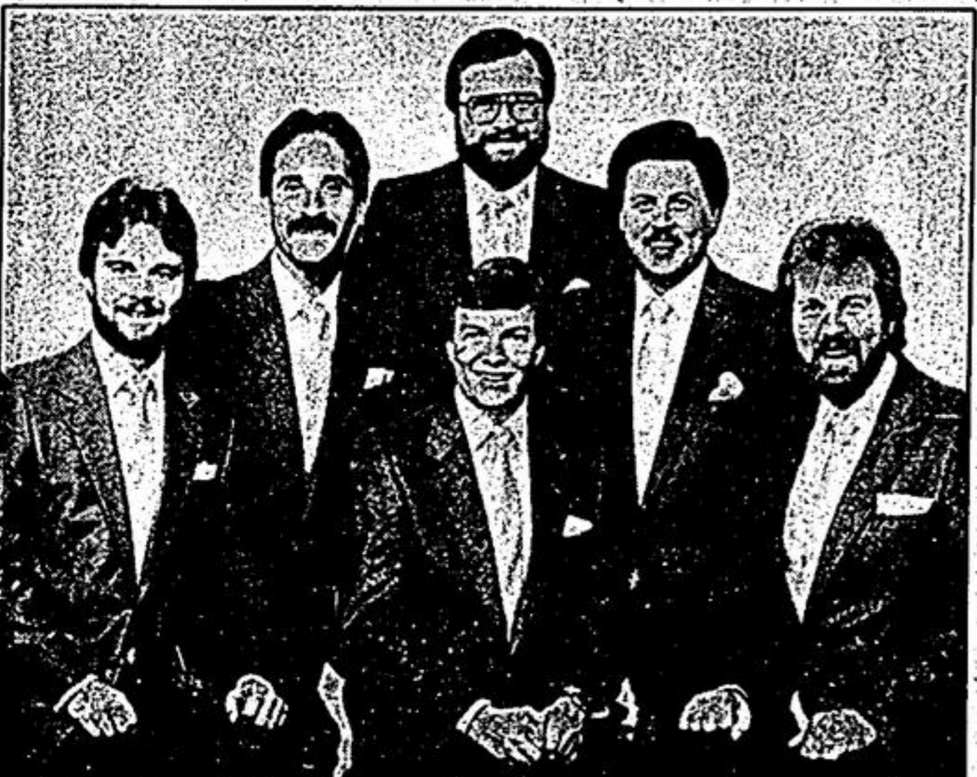
The Watchmen Quartet of Kitchener will present a service of sacred music, Sunday evening, at the Gormley Missionary Church. Time of worship is 7 p.m.