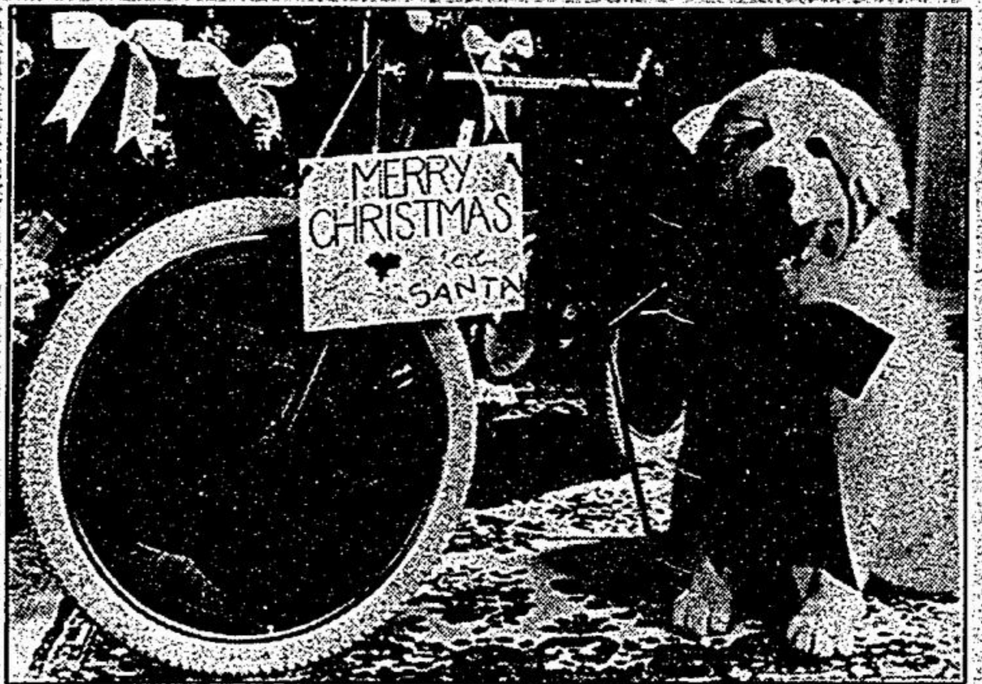
Christmas traditions vary from family to family. Establishing traditions is the best part of the holiday season.