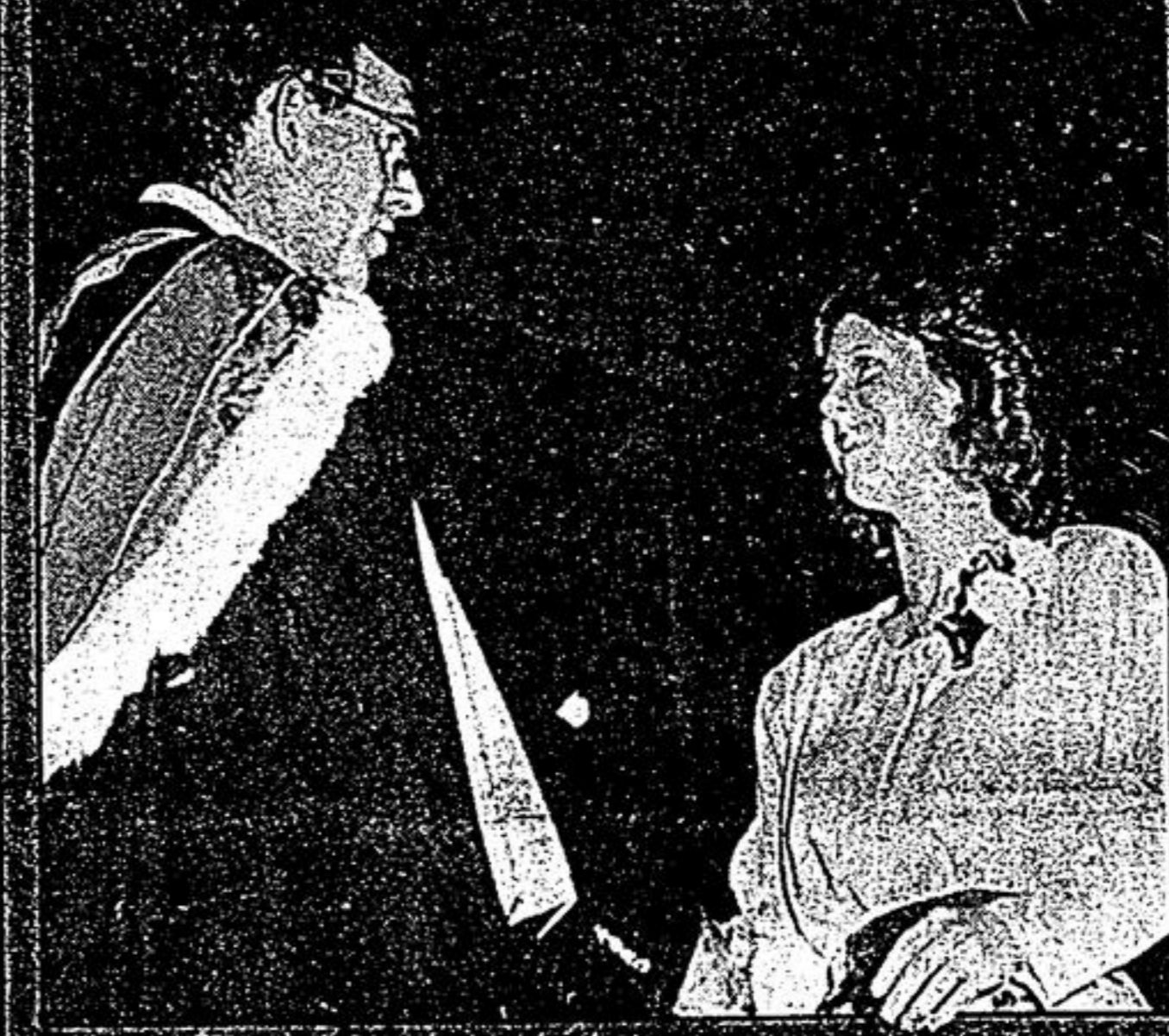
Students share spotlight during the graduation ceremony held at the Uxbridge Community Centre, Uxbridge, Ontario, on Nov. 17. The Mayor of Stouffville, Fran Sainsbury, and the Mayor of Uxbridge, Ontario, are seen presenting awards to the graduates.

asures would have been split 60% (Province), 25% (Region) and 15% (Town). Under the present arrangement, 40% of the cost will be borne by the municipality. Robb listed other shortcomings as well including cost absorption of street lighting on regional roads; refusal to provide the Town with large-size wall maps and rejection of population figure postings on roadside signs. "I'm sure I could come up with more if given time to think about it," Robb fumed. Mayor Fran Sainsbury admitted certain changes in policy seemed to reflect the wishes of urban municipalities to the south. "Certainly, they pay the lion's share of the costs but they also obtain the lion's share of the benefits," she concluded.