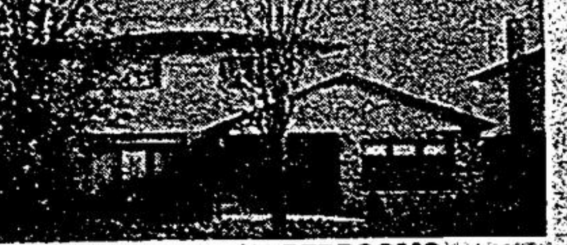
UXBRIDGE - 4 BEDROOMS $159,900

Immediate possession! Maintenance free bungalow, 3 bedrooms, full walkout basement. Vendor has bought and closed!