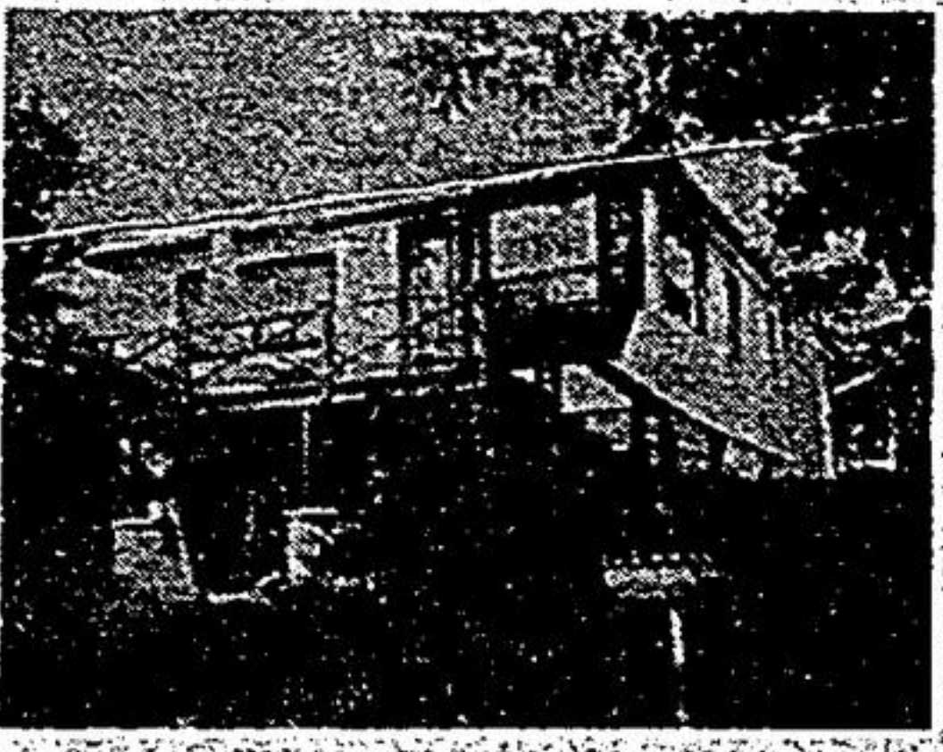
STOUFFVILLE AREA $129,900.

STOUFFVILLE-GREENBELT! Charming brick bungalow, 3 bedrooms, woodstove, updated broadloom over hardwood, plaster walls, new decor, aluminum soffitt, fascia, eaves, recent shingles. Choice lot. Asking $168,900.