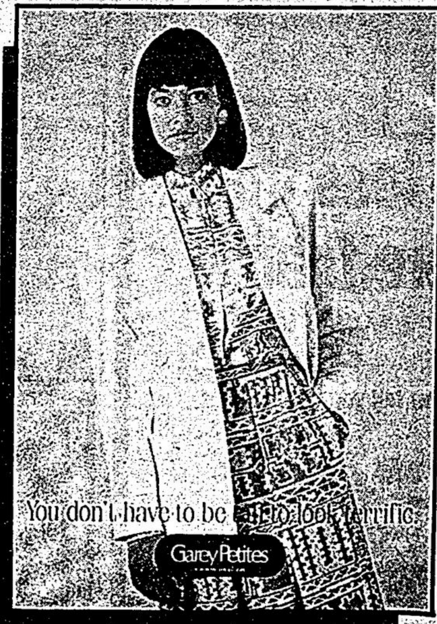
You don't have to be a few look terrific