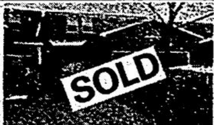
5 DEWIT CR. LARRY RAYMER/RODEEN ANTROBUS