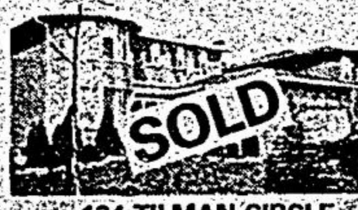
134 TILMAN CIRCLE GAIL CAVILL & GEORGE CROMPTON

ADORABLE & AFFORDABLE $184,900 You'll love this immaculate 3 bdrm, 1 1/2 bath home with family room/fireplace, eat-in kitchen, large front window & huge lot. Janet Donnelly, 294-1372.