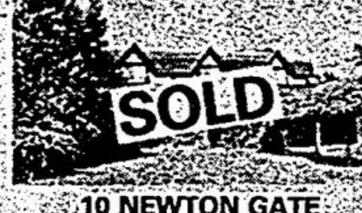
10 NEWTON GATE JOHN & LINDA HAWCO

MARKVILLE CHARMER 3 bedrooms, 3 baths, large eat-in kitchen, rec room, fireplace, full ensuite bath, $173,900. Larry Raymer, 294-1372.