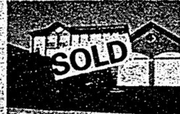
110 SIR LANCELOT DR. JOHN & LINDA HAWCO

BRIDLETRAIL — $294,900 Gorgeous 3 bedroom, sunken living room, cathedral ceilings in family room, French doors, huge lot, plus pool. Rodeen Antrobus, 294-1372.